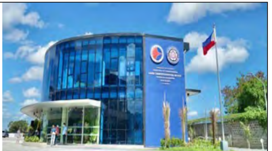
LTO CAVITE. The facade of the newly-inaugurated district office of the Land Transportation Office (LTO) in Imus, Cavite. The LTO on Wednesday (May 12, 2021) said the new office will provide a "much-improved" service to a greater number of clients.- story on p.11

ACCEPTING ADS, PLEASE CALL : 0977-7844136/ 0968-7122927