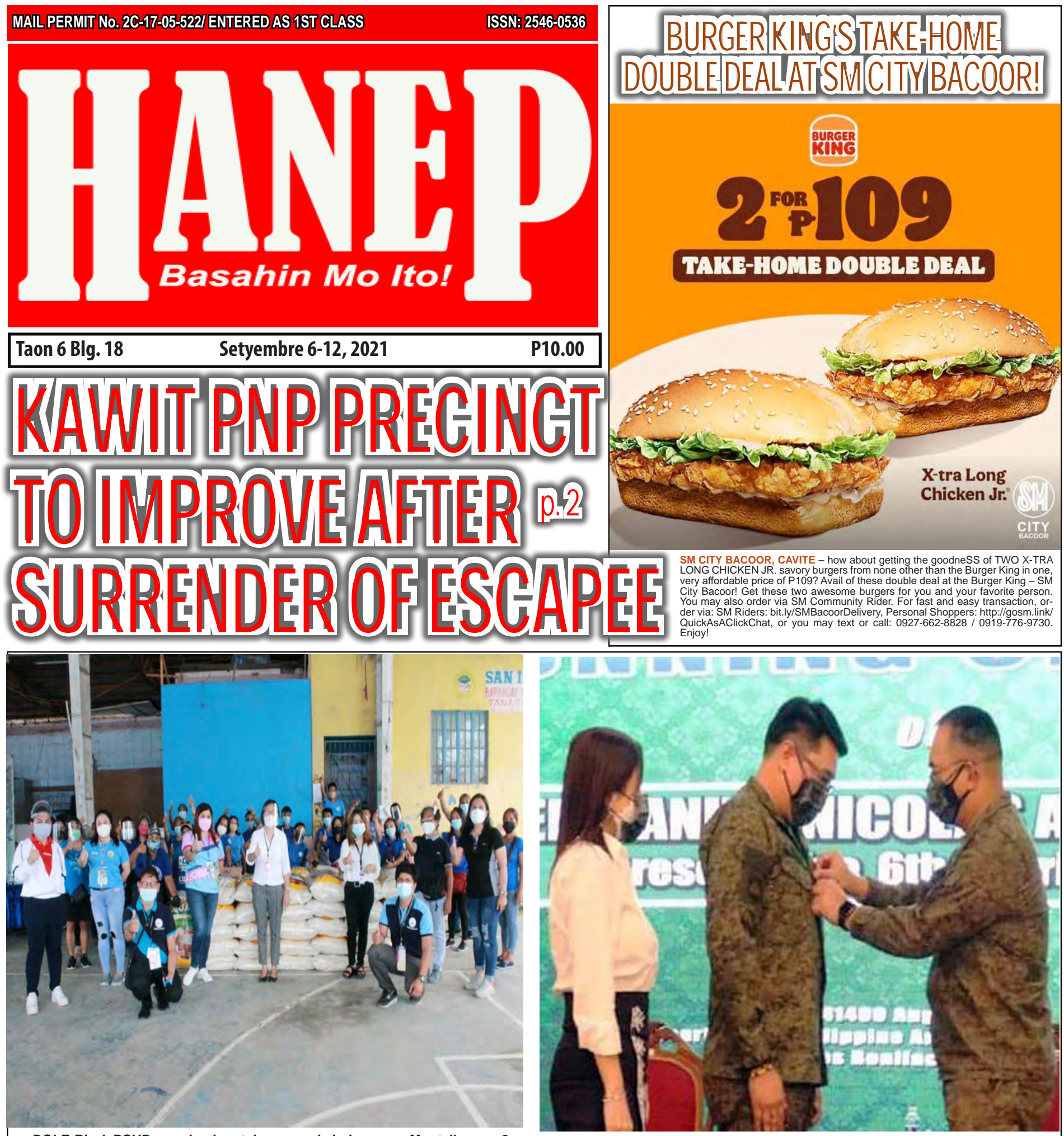
DOLE-Rizal, PCUP namahagi ng tulong pangkabuhayan sa Montalban---p.2

Cavite solon conferred as newly commissioned AFP officer---p.3