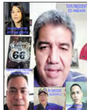
TOPS USAPANG SPORTS

Si Bejino ay may isa pang bitak sa ginto dahil makakarating siya sa Heat 1 ng 50-meter butterfly preliminaries sa 8:36 ng Lunes.