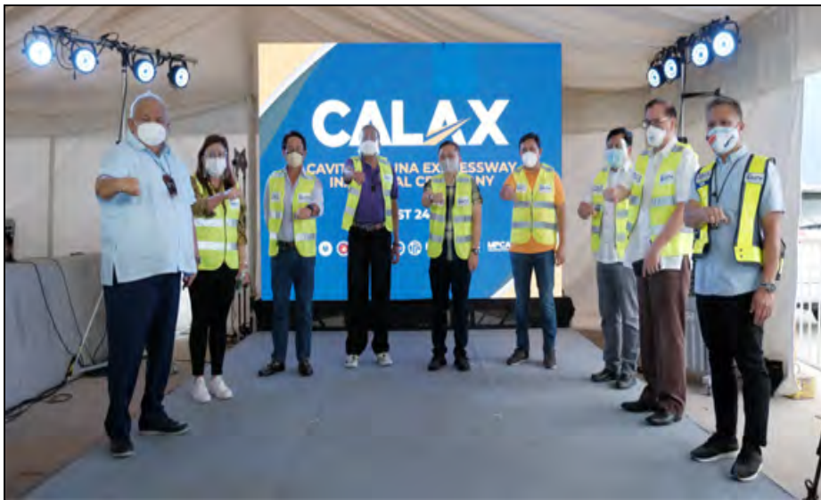
Villar: CALAX Silang East Interchange now open---p.5