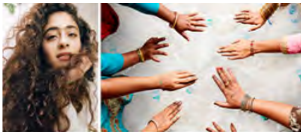
The Body Shop's new vegan routines - the Tea Tree and Moringa haircare range. The Body Shop's new haircare bottles and tubs are made from 100% recycled plastic, including Community Fair Trade recycled plastic collected off the streets of Bengaluru, India. *Not including lids