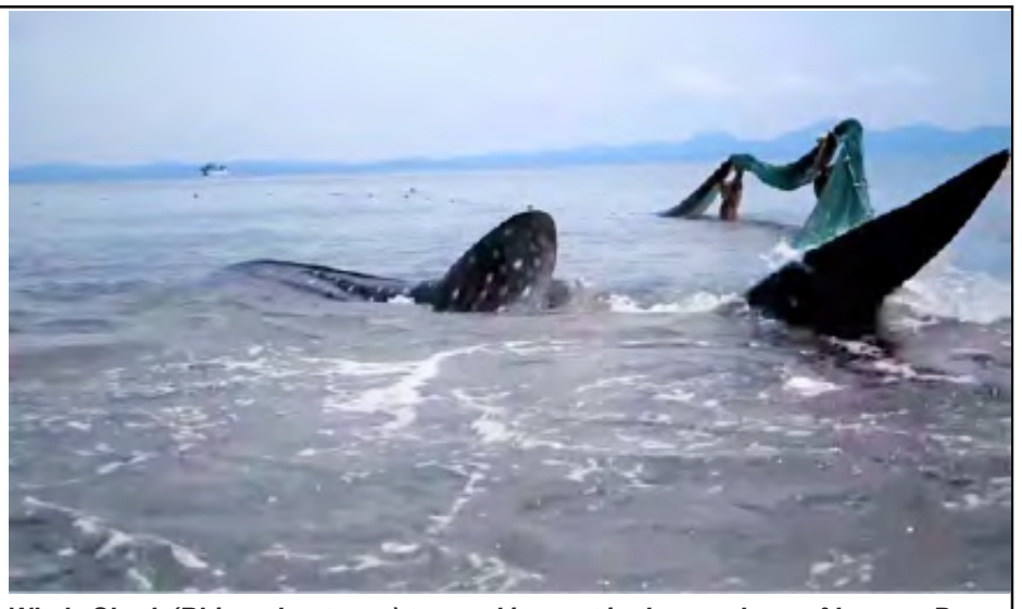
Whale Shark (Rhincodon typus) trapped in a net in the seashore of Lamon, Bay, Atimonan, Quezon.---p.11

ACCEPTING ADS, PLEASE CALL: 0977-7844136/ 0968-7122927