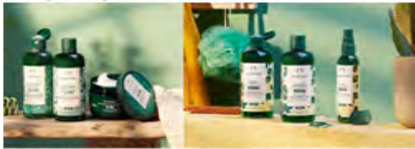
The Body Shop's new vegan Tea Tree haircare line purifies and balances oily hair and scalp made with organically-grown Community Fair Trade tea tree oil from Kenya and Vegan Silk Protein. Bottles and tubs are made from 100% recycled plastic. Brighten up your barnet with The Body Shop's new vegan Moringa Haircare routine that restores dull hair's radiance and shine, and protects hair from daily pollution. Made with Community Fair Trade moringa seed oil and extract from Rwanda and Vegan Silk Protein. Bottles and tubs are made from 100% recycled plastic.

Hair has an attitude, an identity. It tells a powerful story about who you are. Which is why it's so important to keep it in root-to-tip shape. Luckily The Body Shop's new vegan haircare routines are here to help your hair look and feel as powerful as you, so you can keep telling your story, your way.