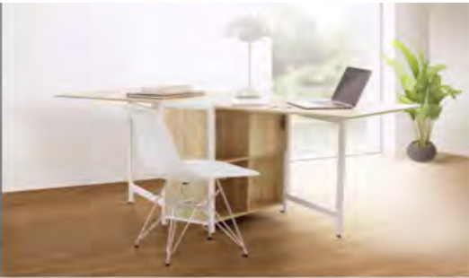
Compact drop-leaf Jacob Desk is easy to fold and easy to keep after a day's work. Perfect for smaller rooms or condos.