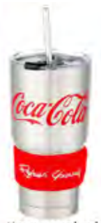
Have a cool cola with this Coca-Cola Insulated Tumbler with Stainless Steel Straw.