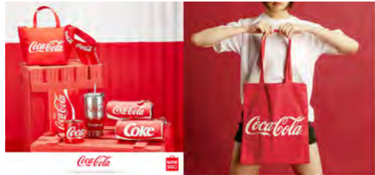
Miniso X Coca-Cola Collection gives a double the happiness for a fashionable lifestyle.