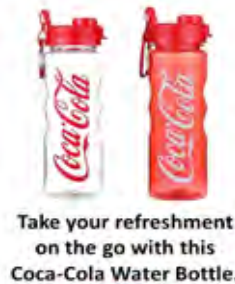
Take your refreshment on the go with this Coca-Cola Water Bottle.