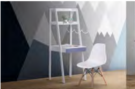
Double deck Scandinavian designed Janine II Desk perfect for small spaces and for your kid's online