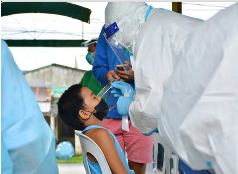
A young boy undergoes antigen testing during the conduct of "Project DELTA" led by DOH-CALABARZON officials and LGU health workers in Barangay Sta. Monica in San Pablo City, Laguna July 30, 2021. (Photo & caption: DOH-CALABARZON)---p.11