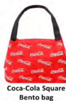
Coca-Cola Square Bento bag