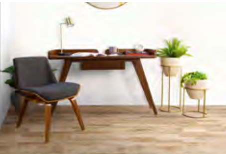
Create a streamlined workspace with this sleek and polished Gavin Office Desk.