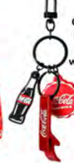
Coca-Cola Keychain Pendant with Bottle Opener.