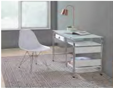
Glass, wood, and metal blend in beautifully in this this modern contemporary designed white Havana Computer Desk.