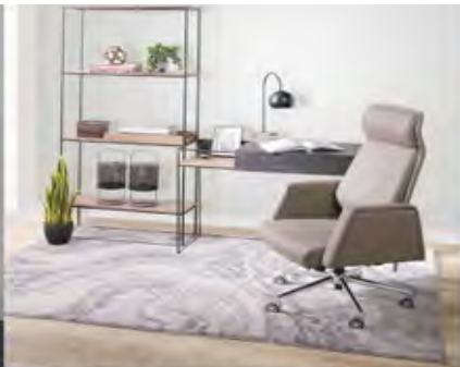
Our Home's Farkins Office / Study Desk has one side for writing and paper work, and another side for storage and décor.

After more than a year of working from home, it's time to indulge yourself by creating a working space that's both decorative and functional. And most likely, the desk will be the centerpiece of one's home office in terms of design and activity.