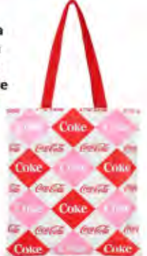
Shop at the nearest Miniso stores and get this Coca-Cola tote bag.