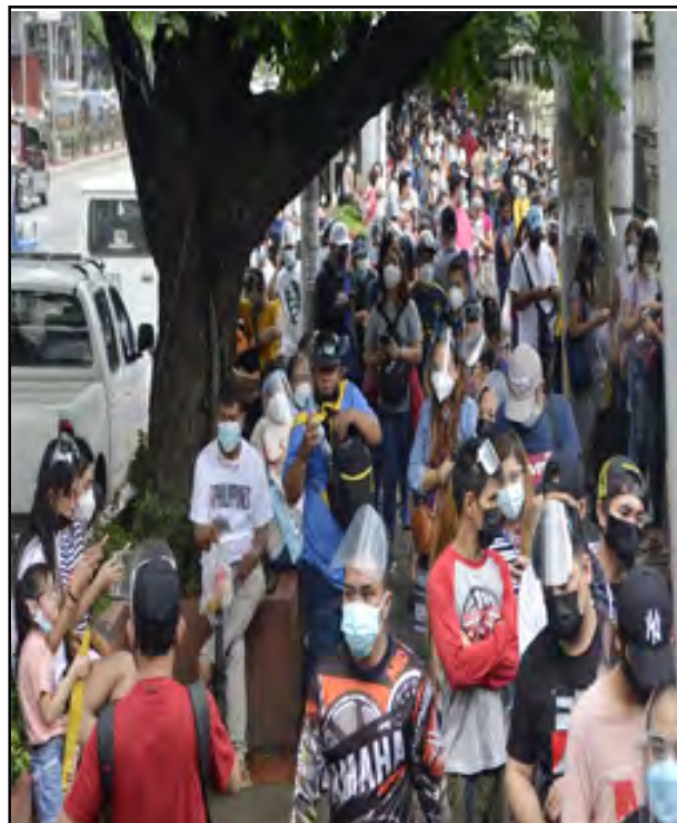
U.S.T VACCINATION 2000 DOSES--- Kita sa larawan ang mahabang pila mula sa Gate 2 ng UST sa Espana na aabot sa Padre Noval, Sampaloc, Manila kamakailan.