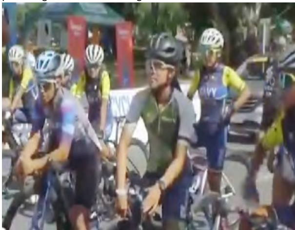
Philcycling National Trial road

"Ipinagdarasal ko na ang mga pagsubok na ito ay markahan ang pagbabalik ng mga kaganapan sa pagbibisikleta sa buong bansa," dagdag ni Oranza.