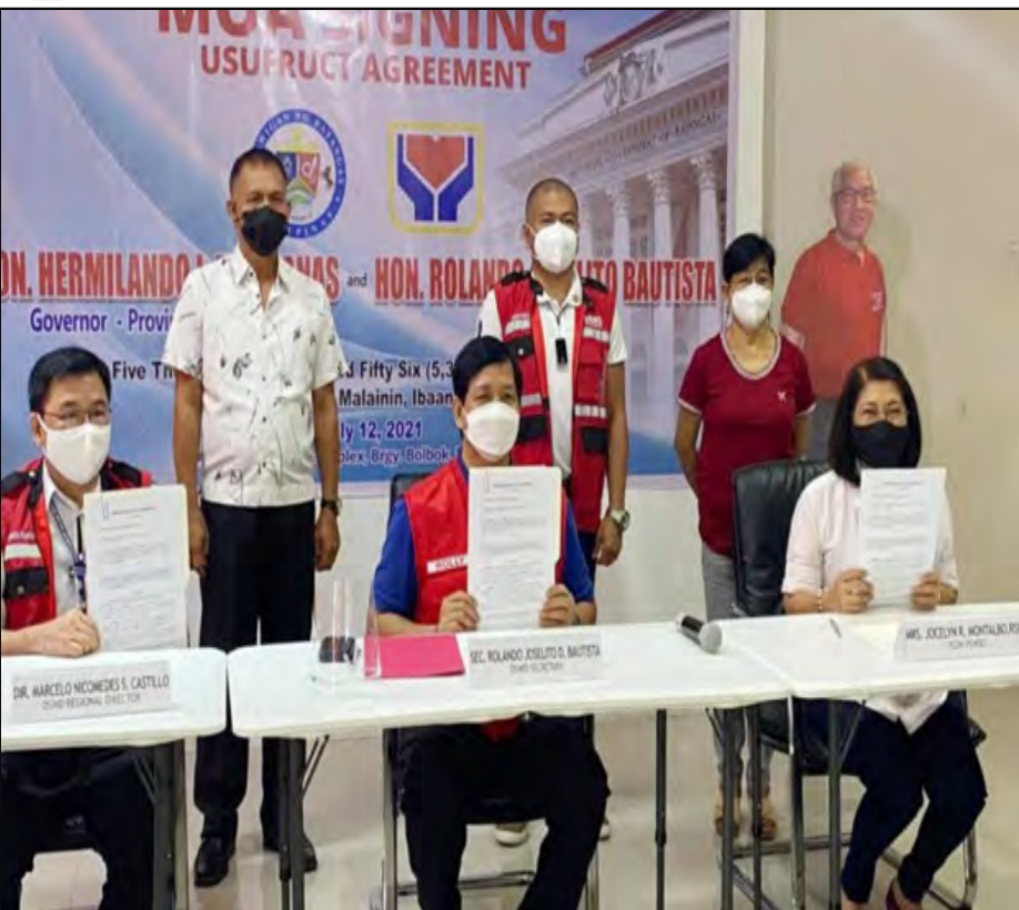
DSWD regional warehouse, itatayo sa Ibaan, Batangas---p.10 (PIA)