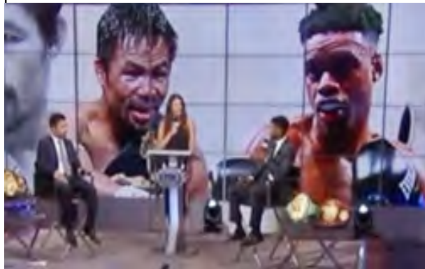
Manny vs Spence

MULING matutunghayan ang bakbakan sa ring ng mag face to face sa press conference kamakailan sila Manny Pacquiao at Errol Spence Jr. Para sa kanilang nakatakdang banatan ngayong August 21 sa Las Vegas.