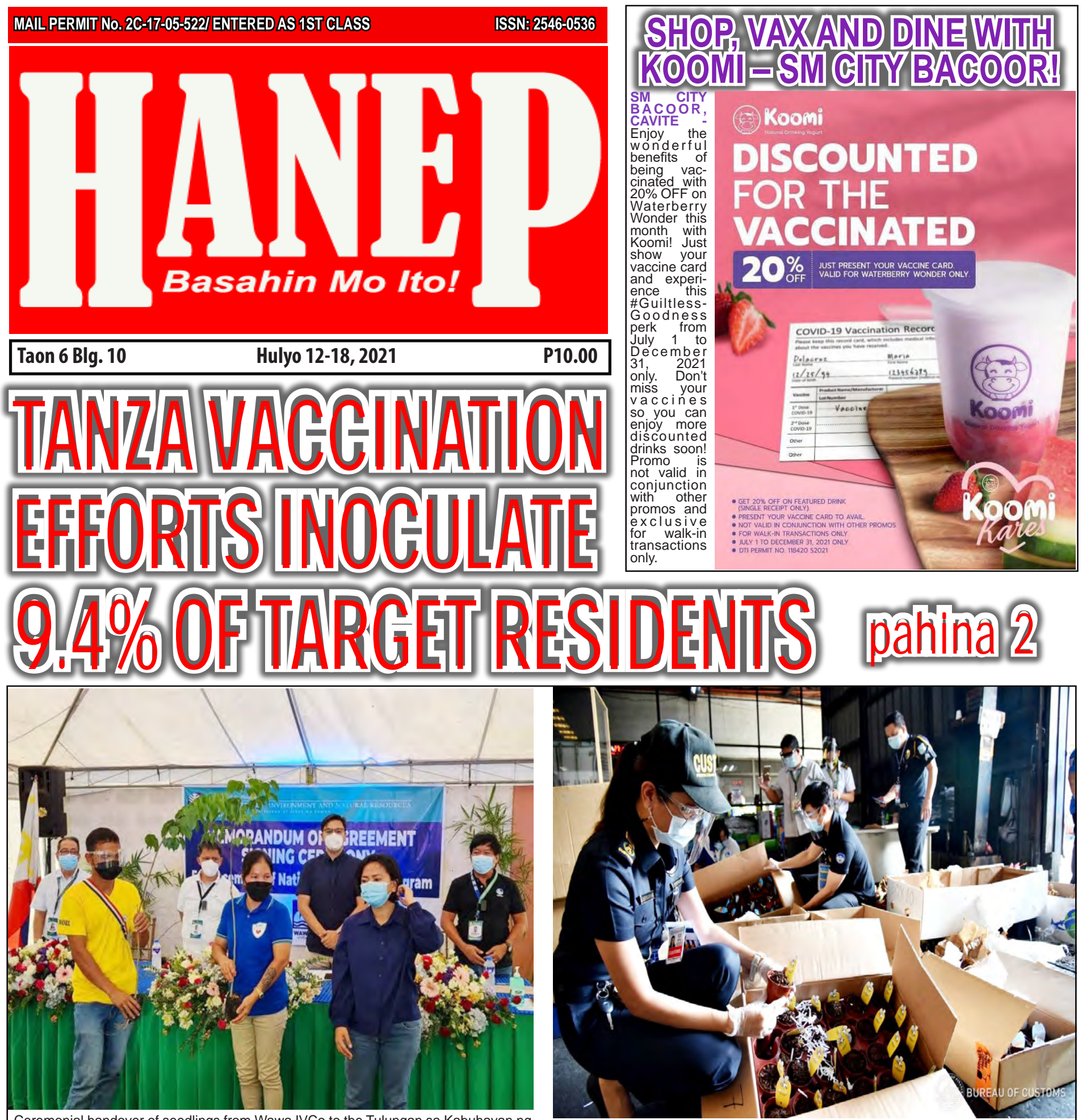
Ceremonial handover of seedlings from WawaJVCo to the Tulungan sa Kabuhayan ng Calawis Inc. People's Organization during the Tripartite Agreement Signing between DENR CALABARZON, WawaJVCO and partner PO for Enhanced National Greening Program last June 18--- p.2