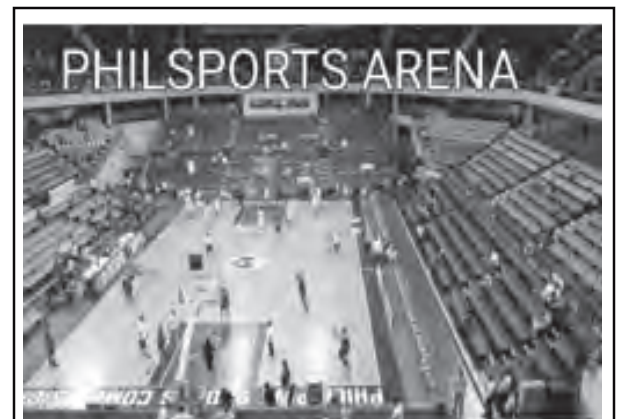
PHILSPORTS ARENA - Magiging pansamantala din na medical pasilidad ang PhilSports Arena sakaling magpatuloy pa ang mga dagsa ng PUI Person Under Investigation dahil sa laganap na Covid-19.