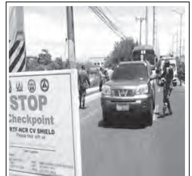
CHECKPOINT. Personnel of the Philippine National Police (PNP) of Dasmariñas City enforce the Luzon-wide enhanced community quarantine (ECQ) to prevent the spread of coronavirus disease on March 30, 2020. The Department of Health (DOH) has been directed to finalize the "analytical model" for determining whether there is a need to extend the ECQ which is set to end on April 12.

Interested may contact DA at (02) 8525-7313 or 8524-0837, or may email at bpi.crpsd.planning@gmail.com. (PIA NCR)