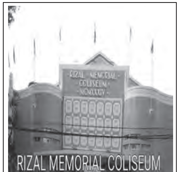
RIZAL MEMORIAL COLISEUM - Ito ang Rizal Memorial Coliseum kung saan ang venue na ginamit kamakailan sa ginanap na 2019 sea games. At ngayong patuloy ang nagaganap na pag dagsa ng mga nagiging positibo sa cove2019 ay magiging pansamantalang medical pasilidad. (RGN)