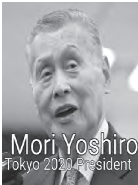
Mori Yoshiro Tokyo 2020 President