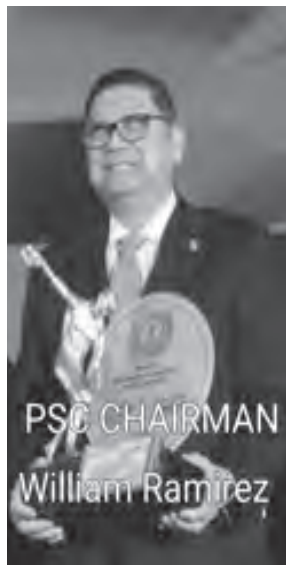
PSC CHAIRMAN William Ramirez

Ang pasilidad ng Philippine Sports Commission (PSC) ay malapit nang maging pansamantalang mga medikal na pasilidad upang matulungan ang mga decongest na mga ospital habang ang digmaan laban sa coronavirus disease (Covid-19) ay nagagamit sa mga impeksyon na umaabot sa higit sa 1,418 hanggang Linggo. Kinumpirma ni PSC Chairman William Ramirez na ang dalawang sports complex ng gobyerno sa Metro Manila, na ang Rizal Memorial Sports Complex sa Maynila