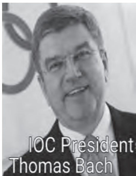
IOC President Thomas Bach

kaso, karamihan sa mga nahawahan ay nagdurusa lamang mga sintomas ng banayad at gumaling.