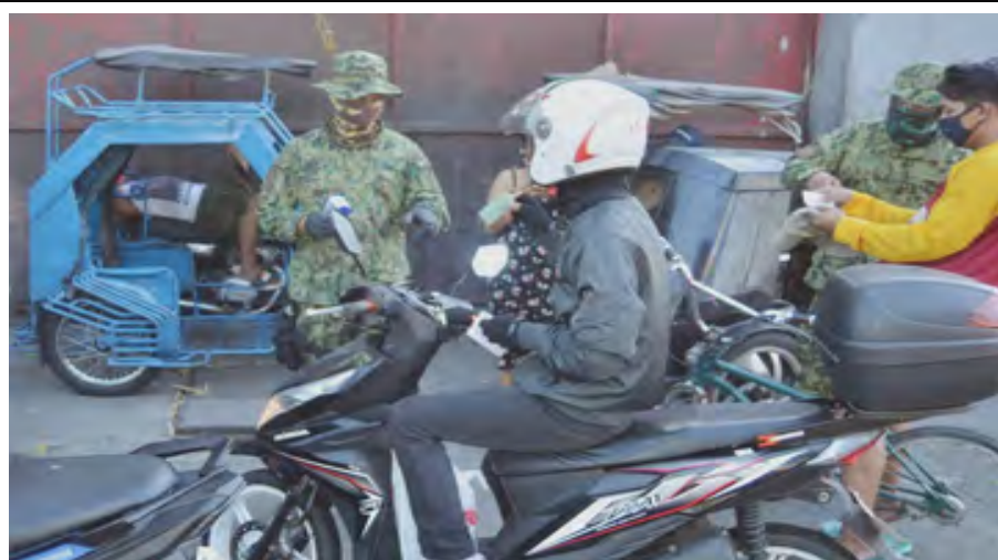
CHECKPOINT ng Manila Police District Station-5 sa kahabaan ng Mel Lopez Ave. (formerly R10) sa paanan ng Delpa Bridge, Port Area. Sasalang sa thermal scanner ang lahat at ang walang barangay quarantine pass ay hindi pinapasok o pinaparaan.