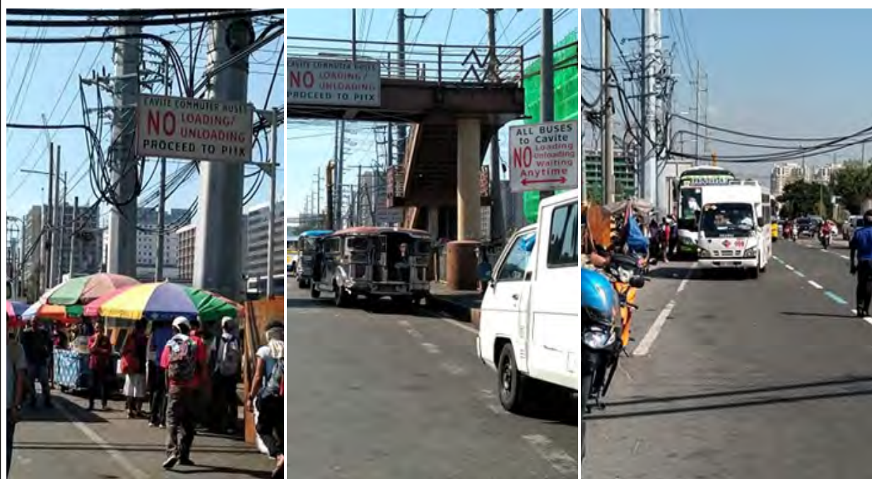
ILAN lamang ang mga ito sa dapat linisin ng MMDA upang maayos na nagagamit ang motorcycle lane sa kahabaan ng Roxas Boulevard. RS

Nakabukas po ang pitak na ito o ang aming pampasaherong bus at dyip na may bahagi rin na mayroong kariton ng pan-