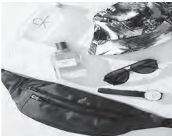
Casual and cool presents for guys - Calvin Klein CK One Eau de Toilette, SM Accessories Bucket Hat, Sunnies Studio Sunglasses, Kenneth Cole Classic Watch, SM Accessories Belt Bag, and Givenchy Gentleman Only Eau de Toilette.