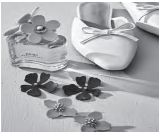
Saying it with flowers: Marc Jacobs Daisy Eau de Toilette, SM Accessories blossom earrings, and Parisian Avery shoes.