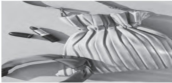
For the girl who loves her basics, stick to something classic - SM Accessories bag and headband, and MAC Matte Lipstick in Chili.

Visit The SM Store today and share the love this Valentine. Follow The SM Store on Facebook, Instagram, and Twitter.