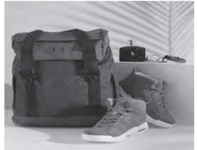
Laid-back luxe: Travel Basic Quill Backpack, Ralph Lauren Polo Eau de Parfum, Kenneth Cole Transparency Silver Watch, SM Accessories Blue Tracker Watch, and Sprint Quavo Basketball Shoes. Catch the hottest men's fashion essentials at The SM Store today.

Republic of the Philippines REGIONAL TRIAL COURT Fourth Judicial Region Branch 109, Carmona, Cavite