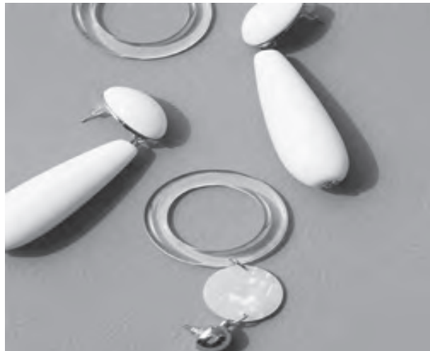
Be date night-ready with these chic dangling earrings. Your Valentine's Day must-haves are at The SM Store now.