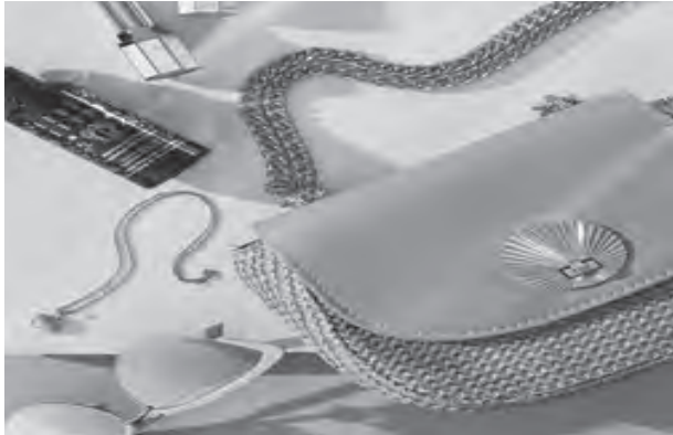
The blush brigade: SM Accessories bag, Dickies girl sunglasses, F&C jewelry heart pendant with chain, Bobbi Brown Intensive Skin Serum Foundation, and Dear Dahlia Lip Paradise Intense Satin Lipstick from The SM Store.