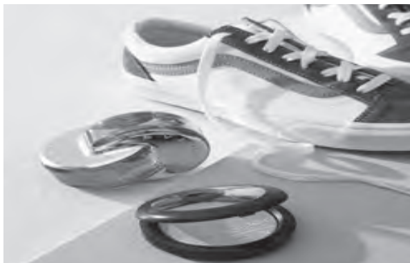
Athleisure glam. Vans Retro Sport Style Sneakers, Bvlgari Omnia Amethyste Eau de Toilette, and MAC Extra Dimension Skin Finish in Double Gleam. Check them out at The SM Store today.