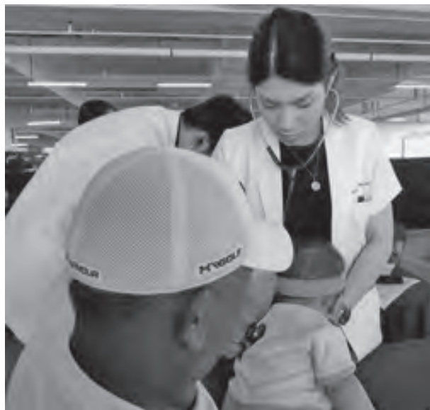
Volunteer doctor checking a baby who has been suffering from Asthma. The beneficiary has been given proper medical attention and medication after.

SM Foundation is the heart of SM group of companies focused on social inclusion by nurturing and caring for underserved communities where SM is present. SMFI is committed to serve by supporting and empowering SM host communities through education, healthcare, shelter, disaster response, farmers' training, environmental programs and care for persons with special needs.