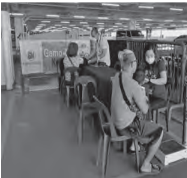
Volunteer nurses taking the vital signs of every patient before the medical consultation.