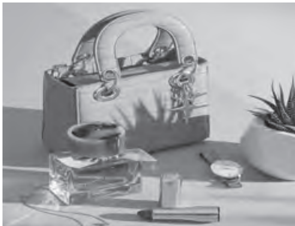
Gifts of timeless style from The SM Store - Parisian Blair Bag, Kenneth Cole Watch, Clarins Joli Rogue Lipstick, F&C Jewelry Love Necklace, and MyBurberry Eau de Parfum.