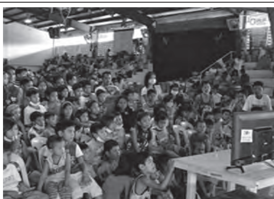
Evacuees in Sto. Tomas, Batangas together with their children enjoy the newly installed LED TVs as they watch various health infomercials of the Department of Health including advisories on food safety and health effects of ash fall. A total of 10 LED TVs were given to evacuation centers in the municipalities of Sto. Tomas and Tanauan in Batangas.