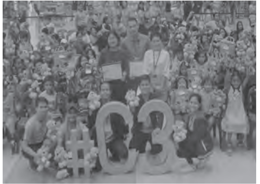
The Children Christmas Concert was full of fun, excitement and gratitude.