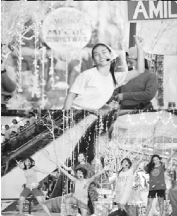
Championing Community Children's volunteers performed as a treat for the children.