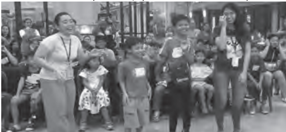
Fun games were held to make the event more fun and exciting.