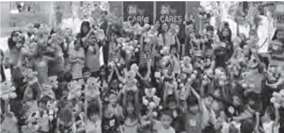
Children were very excited to play with their new SM Bears of Joy.