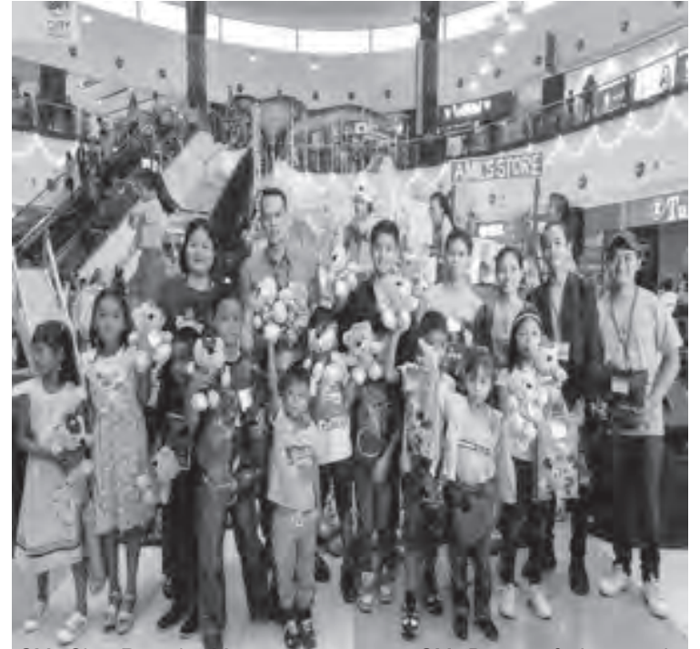
SM City Rosario Managers turnover SM Bears of Joy to the Championing Community Children.