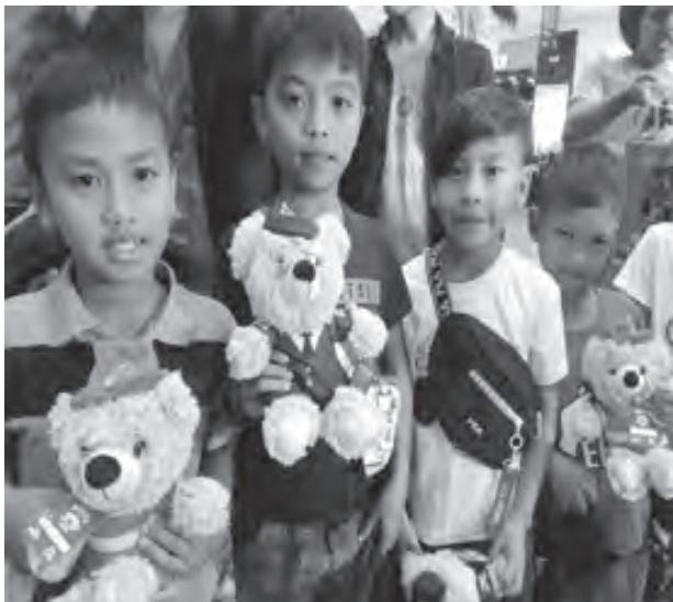
C3 Children were happy with the SM Bears of Joy.