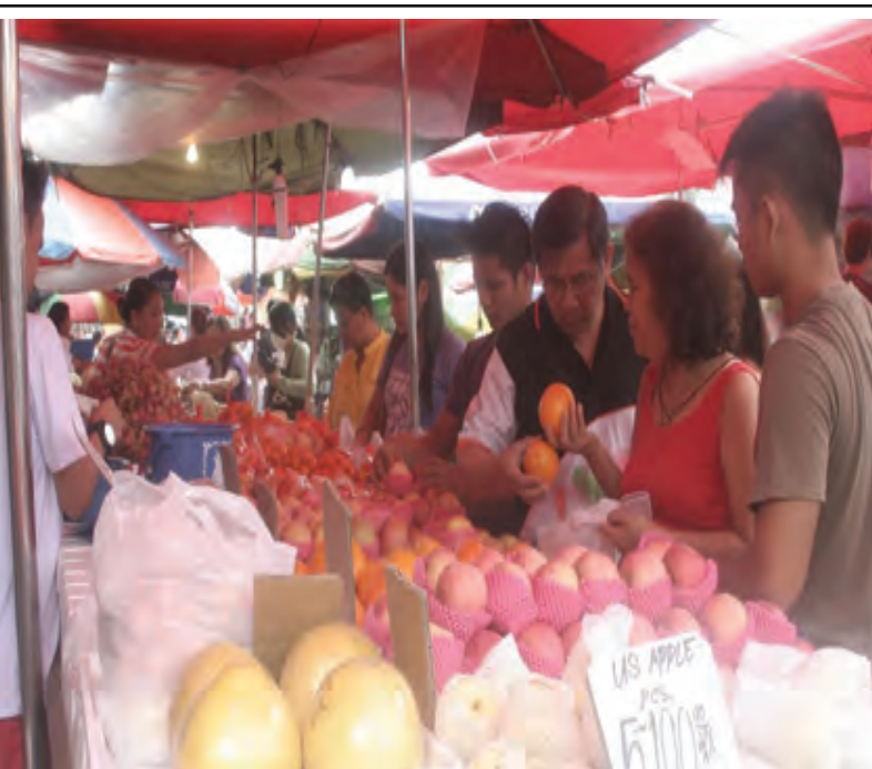
NAKAUGALIAN na ang pagbili ng mga bilog na prutas sa paniniwalang pampaswerte sa pagsalubong sa Bagong Taon kahit ang mga ito ay nagmahal ang presyo. Kuha ito sa Baclaran, P'que City.

LAST SUNSET OF THE YEAR 2019: Maisasalarawan ang huling paglubog ng araw sa katapos na 2019 bilang pagpapaalam ng isang buong makabuluhang taon at pagsalubong naman ng panibagong bukas para sa 2020.