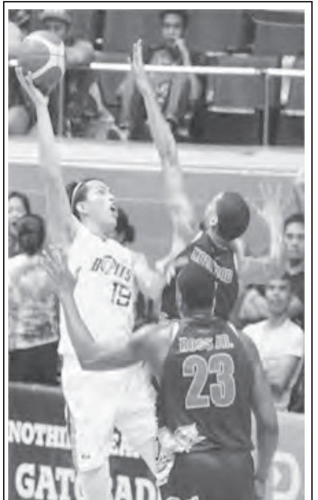
PBA FINALS - Ilan lamang ang aksyon na ito sa pagitan ng Meralco at Rain or Shine kung saan kasagsagan naman sa finals ng Ginebra at Meralco na sinimulan ngayong Enero 8 ang game 1 para sa 2019 PBA Governors Cup finals (RGN)