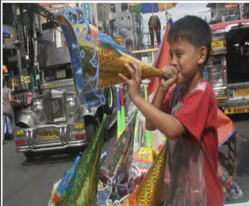
IPINAPAKITA ng batang ito sa publiko ang paggamit ng torotot bilang panghihikayat sa halip na na gumamit ng paputok upang iwas disgrasya sa pagsalubong sa Bagong Taon.