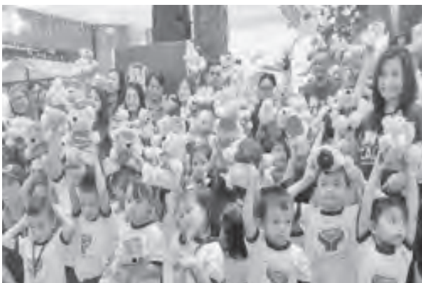
Children from Panapaan 5, Day Care Center, Bacoor City with their new cuddly friends SM Bears of Joy, and the volunteers from SM City Bacoor

SM Bears of Joy collected from the SM Bears Of Joy Project. And who would not smile with the sight of our favorite bee? Children were delighted as Jollibee gave a surprise dance number before they enjoy their journey with the exciting Rides at SM Storyland's Orbiter Ferris Wheel and Train. Simultaneously, Fifty (50) kids from Citihomes Day-care Center were given a special treat by twenty-three (23) Volunteer Employees of SM City Molino during their ChriSMiles Program. Exciting games such as Candy Color Coding, The Boat is Sinking, and Stop Dance brought the children more fun. The employee volunteers also performed a special number followed by an intermission number performed