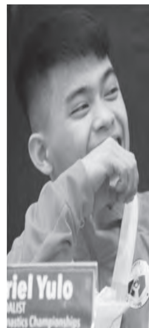
Gymnastic Gold Medalist Carlos Yulo