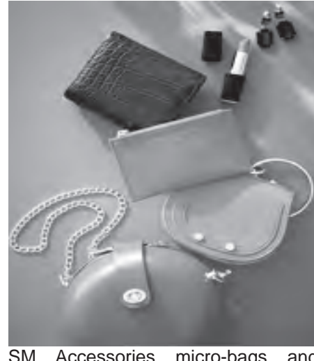
SM Accessories micro-bags and other great finds just in time for party season.