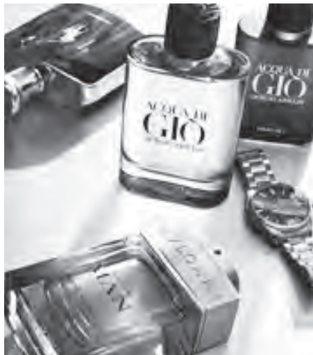
Scents for your special someone do the magic this Christmas.