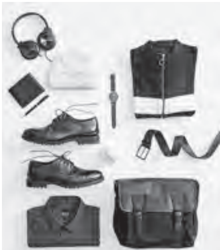
Monochromatic gifts for the modern gentleman available at The SM Store.