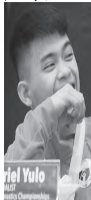
Gymnastic Gold Medalist Carlos Yulo