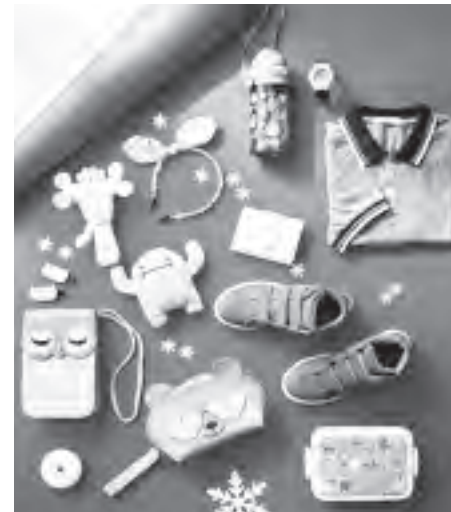
Cute gifts for kids of all ages and Secret Santa gifting ideas.