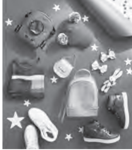
Gifts for kids that get a star! Perfect gifts in the form of trinkets in shades of reds and gold.