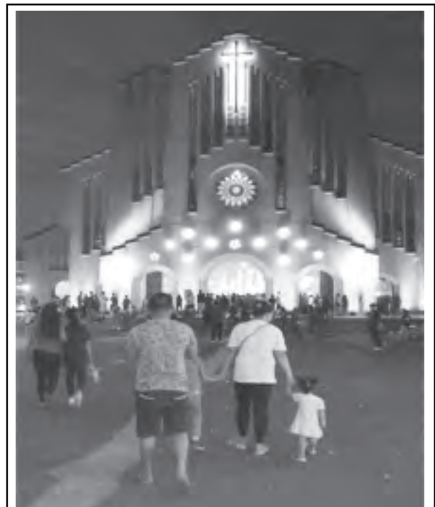
ISA ang National Shrine of our Mother Perpetual Help, Redemptorist Church sa Baclaran, Paranaque City ang dinarayo ng mga deboto sa panahon ng Simbang Gabi.