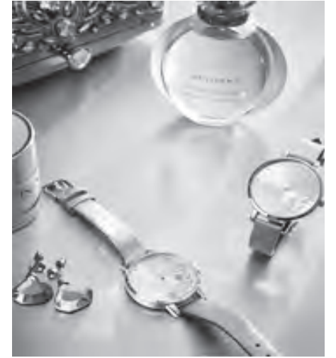
Make her yuletide glow. Put one of these in a box and top with a bow. Gifting selections include scents, timepieces and other accessories, all available at The SM Store.