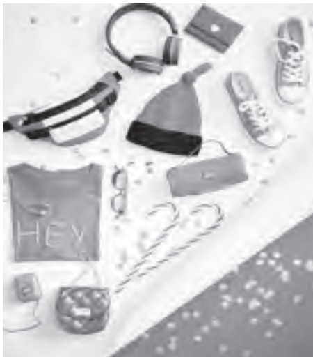
Pro-tip: Throw in a penny board if you're feeling extra generous. Get stylish gifts for kids this Christmas at The SM Store.