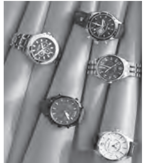
Nothing quite like a gift of time. Shop timepieces at The SM Store.