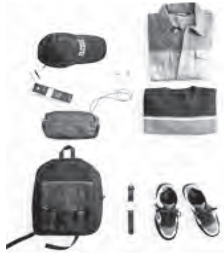
We have the men and teen boys from your Christmas gifting list covered. Fill your wrappers with these items from The SM Store.