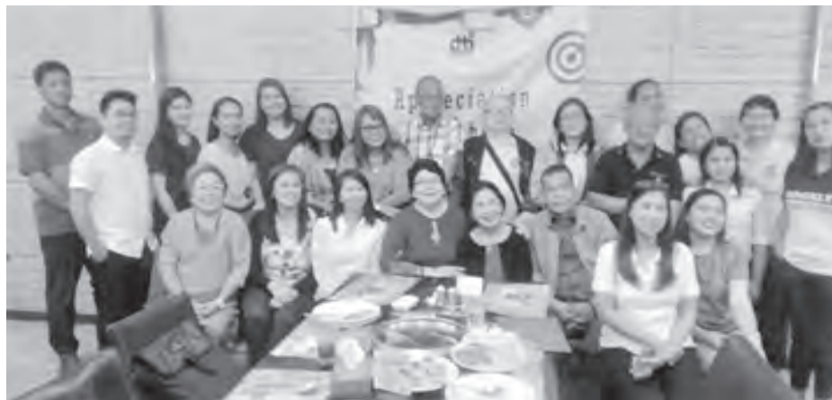
NAGKALO OB ng 'Appreciation Luncheon' ang Department of Trade Industry-Province of Cavite kamakailan sa media at mga kaagapay na ahensiya.

The second industrial revolution saw the usage of electricity, mass production, and division of labor in the 1800s, while the third industrial revolution, started in the late 1960s with the advent of electronics, IT, and automated production. (DTI/PIA-NCR)