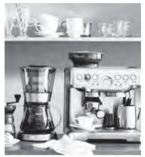
Brew good gifting points this Christmas with presents that will wow your loved ones.