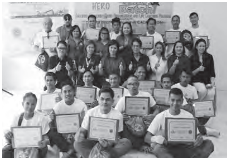
The 19 successful PWUDs graduates of Bacoor City, Cavite. BOY NAMORA

nies were held on December 5 and 6, respectively. Janairo also added that the graduates will continue to have training in skills development that will be conducted by their respective local government units. "This will provide them the personal development they need which will not only increase the opportunities for livelihood but will also empower them as an individual," he further explained. The Modified Community-Based Rehabilitation Program (CBRP) for Persons Who Use Drugs (PWUDs) was a joint endeavor with the local governments of Bacoor City and Antipolo City. BN