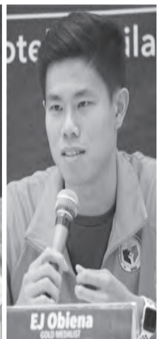
Pole Vault Gold Medalist – EJ Obiena