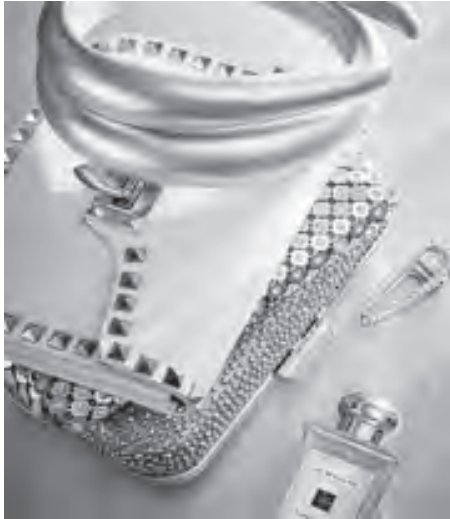
Glam gifting ideas for the ladies available at The SM Store.

Visit The SM Store today and share the joy with us on social media using #ItsChristmasAtSM.