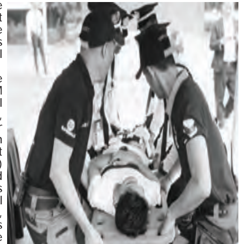
Emergency Response Team while attending to injured personnel