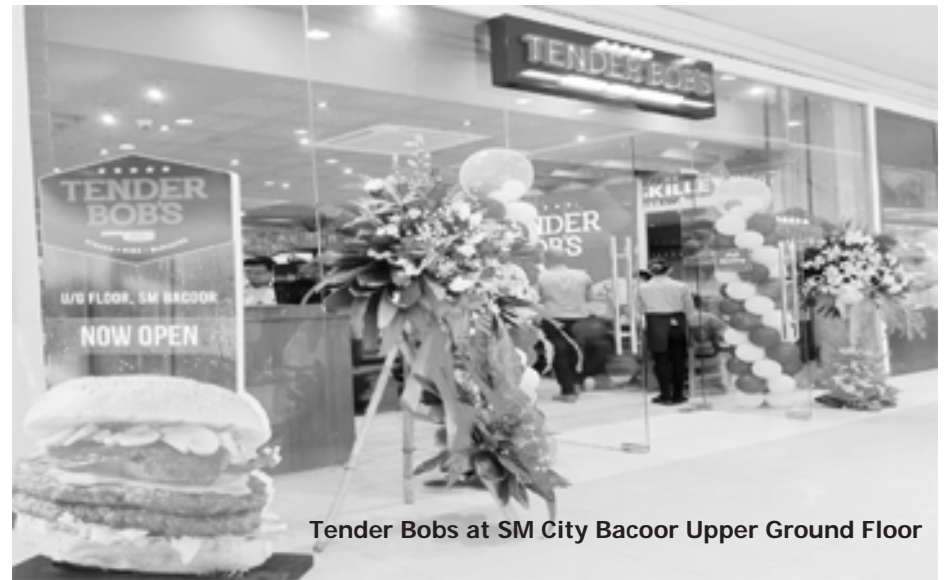
Tender Bobs at SM City Bacoor Upper Ground Floor