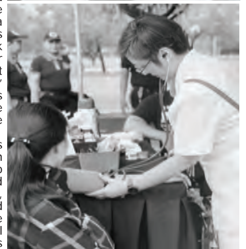
SM City Bacoor's Nurse while checking vital signs of a pregnant shopper during the evacuation