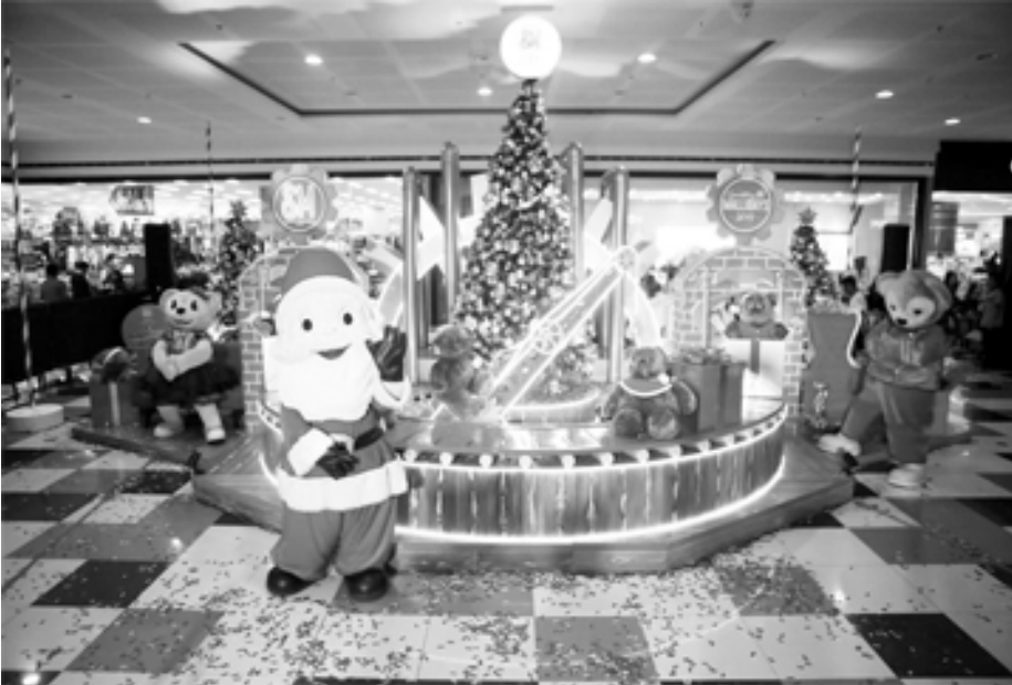
SM Santa danced with his Bear factory workers during the Christmas Centerpiece unveiling at SM City Trece Martires

SM City Trece Martires, Cavite – Indeed the happiest season is finally here at SM City Trece Martires as they officially unveiled the Beary Merry Christmas Centerpiece featuring the cuddly friends working for Santa's factory.