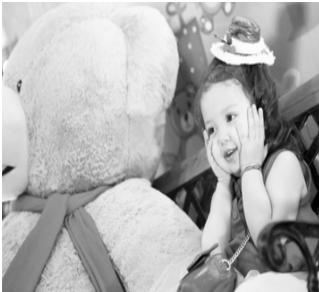
This adorable kid sat down with the giant bear at the Beary