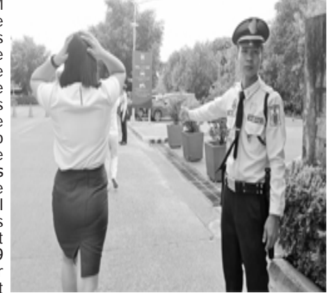
Security Guards guiding SM City Bacoor Employees while evacuating

Along with all the properties of SM Prime Holdings all over the Philippines, the National Disaster Risk Reduction and Management Council (NDRRMC) also encouraged and supervised drills conducted by Local Government Units, Schools, Business Sectors and Private Organizations nationwide.