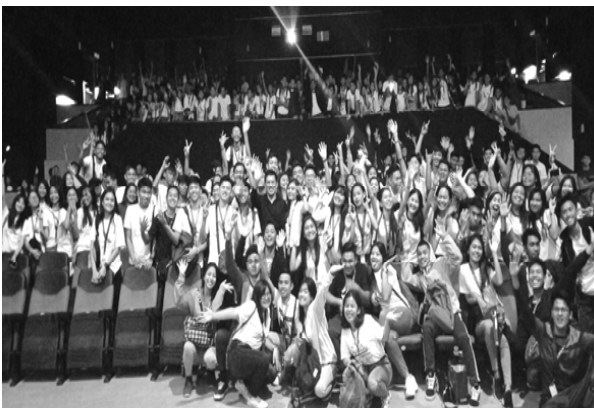
Director Brillante Mendoza with the senior high school students of the University of Perpetual Help-Molino Campus