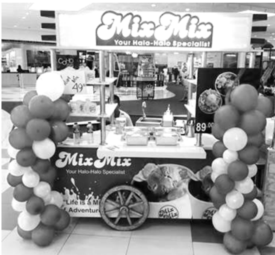
Mix mix at SM Center Imus

SM CENTER IMUS, CAVITE - Who says halo-halo's just for summer? Well you don't need to wait for next year to taste your favorite Filipino refreshment because Mix Mix Your Halo-Halo Specialist is now ready to serve you at SM Center Imus! Enjoy their 100% halo-halo uniquely served in milky ice much like but better than a bingsu. And who says coffee and halo-halo can't be a fusion? Get on cloud nine over their Coffee Dream flavored halo-halo. You can also go fruity with their Banana Langka Flavor, Mais Con Hielo and of course, their Halo Halo Supreme. Get to choose your own toppings to complete your favorite halo-halo chill! So hurry and grab your own Mix Mix now at SM Center Imus!