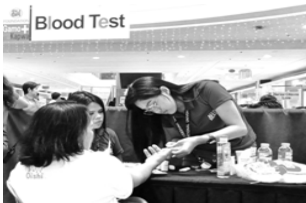
Volunteers from National University conducting blood tests to one of the beneficiaries.

SM Foundation is the heart of SM group of companies focused on social inclusion by nurturing and caring for underserved communities where SM is present. SMFI is committed to serve by supporting and empowering SM host communities through education, healthcare, shelter, disaster response, farmers' training, environmental programs and care for persons with special needs.