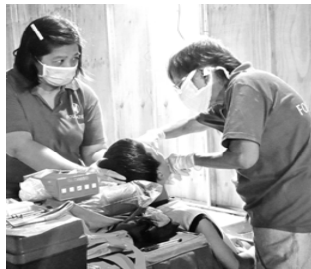
Volunteer Dentists conducting tooth extraction with SMFI Volunteer.