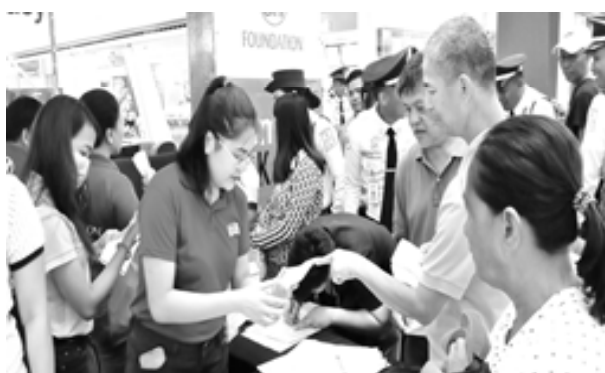
Beneficiaries claiming free medicines at the Pharmacy station.