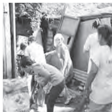
'WE are all responsible': Photos show the cooperative efforts of the residents of Barangay Aplaya in the clean-up drive launched recently by Environmentalist Mayor Angelo Emilio Aguinaldo. The local chief executive enjoins them to actively participate in all the projects of the local government to make Kawit one of Cavite's cleanest municipality.