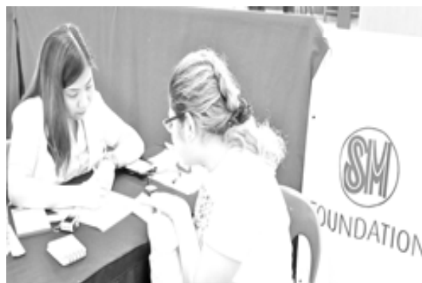
Free Consultation at SMFI Medical and Dental Mission.