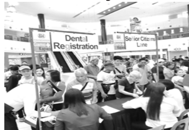
Senior Citizens and some employees queued for the Medical Mission.

Various specialty services such as Internal Medicine, Pediatrics, Ophthalmology, ENT, OB-Gynecology, Urology and Surgery were provided. Blood testing, ECG, ultrasound and Xray were also conducted by the mission. SM Foundation is the heart of the SM group of companies, committed to serve by supporting and empowering communities through education, healthcare, disaster response and farmers' training.