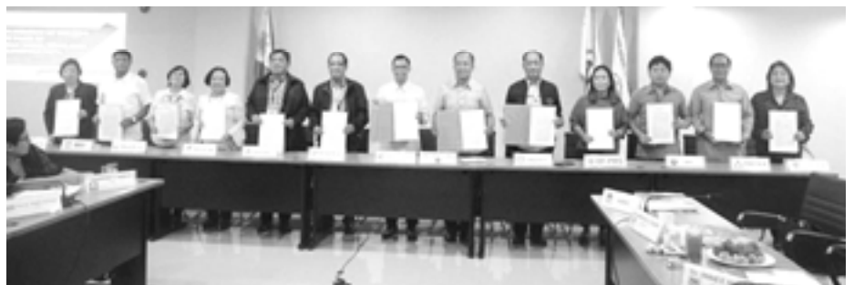
Regional Development Council Members of RIVA showing the signed MOA for the establishment of the Forest Park in Antipolo City, Rizal.

REPUBLIC OF THE PHILIPPINES REGIONAL TRIAL COURT IMUS, CAVITE