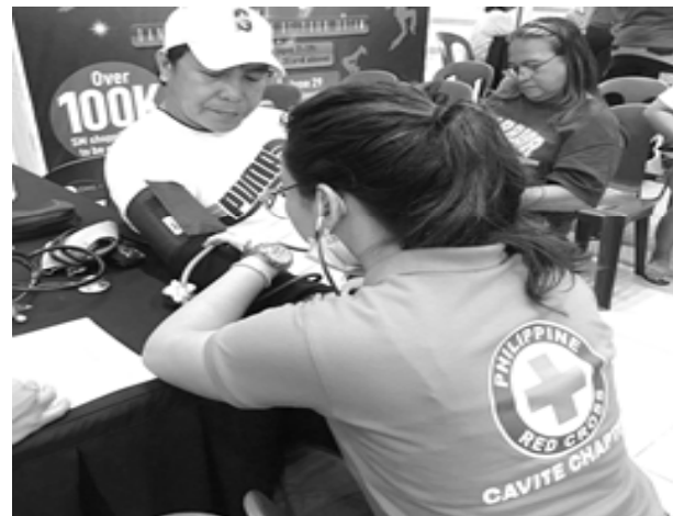
Philippine Red Cross also supported the event by getting the vital signs of the patients.