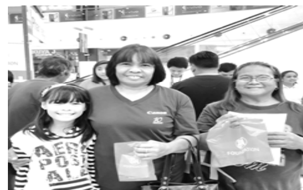
Medicines from Gamot para sa Kapwa were given to the patients after Doctor's consultation