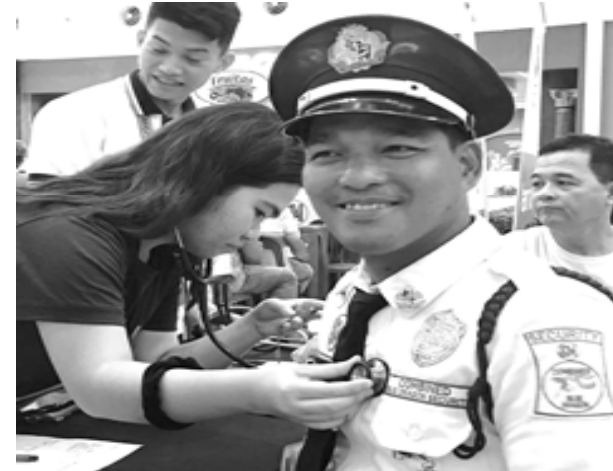
While getting his vital signs, SM Security Guard shows his sweetest smile.