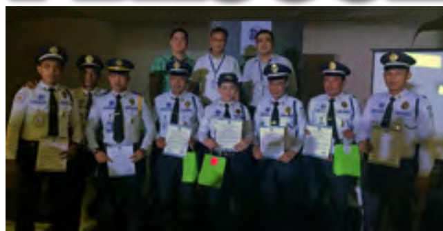
Some of the honest employees of SM City Bacoor