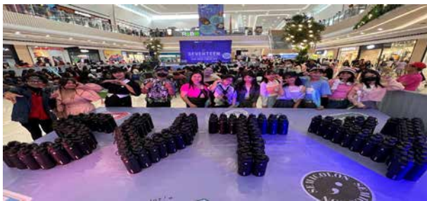
Armies and Carats in their K-Pop outfit posed at the SVT AquaFlask Installation at SM City Tanza during the BTS x Seventeen K-Pop night.