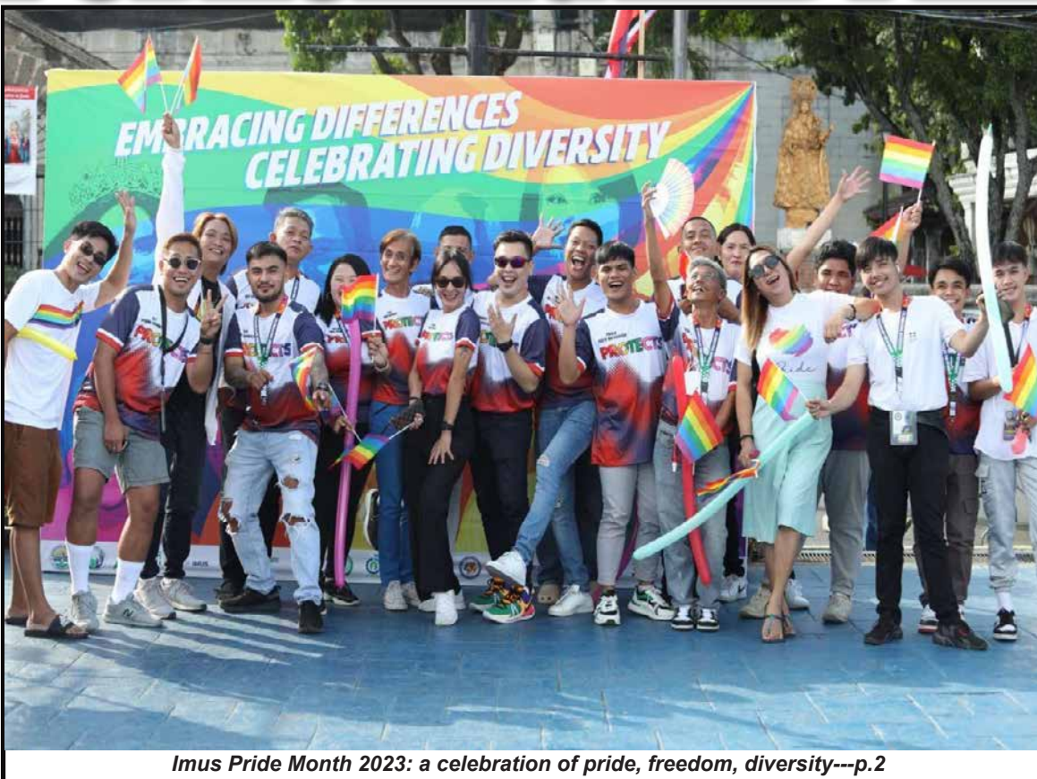
Imus Pride Month 2023: a celebration of pride, freedom, diversity---p.2