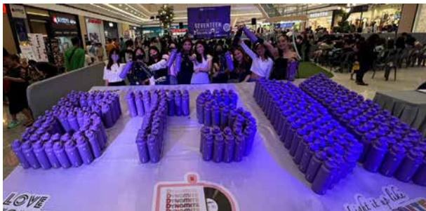
"Cheers for more K-Pop nights at SM Supermalls" –Armies and Carats while holding the AquaFlask Thermal Bottles during a K-Pop night at SM City Tanza.