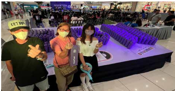
Grandparents support K-Pop fandom of their GenZ granddaughter and took a photo with her at BTS AquaFlask art installation.

vibe to the mall. Nonetheless, what made the event so amusing and remarkable was the vast art installation of BTS x SEVENTEEN logo amassed using 1,400 AquaFlask thermal bottles. K-Pop generation compliments AquaFlask's advanced and innovative design and technology that makes it top 1 thermal bottle in the Philippines.