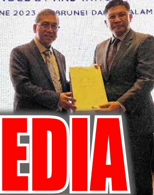
Science secretary leads the Philippines at the 12th Informal ASEAN Ministerial Meeting on Science, Technology, and Innovation (IAMMSTI-12)---story on p.6A

THE 12 TH INFORMAL ASEAN MINISTERIAL MEETING SCIENCE, TECHNOLOGY AND INNOVATION (IAMMSTI-12) 22 JUNE 2023 BRUNEI DARUSSALAM