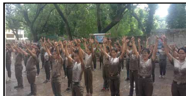
SINIMULAN na ng Philippine Army ang pagsasanay ng ilang indibidwal upang maging mga reservists at mapabilang sa hanay ng mga aktibong laang kawal ng Reserve Command, Philippine Army. Karamihan sa mga nasabing reservist candidates na nagsasanay ngayon ay mga civilian volunteers ng Bravo Coy, 402nd (Cavite) RRIBn, 402nd CDC, RESCOM PA.

ng Roxas Boulevard, patungong North Harbor sa Pier 4 sa Tondo, Maynila. Ang mga naarestong suspek na nagtago sa lungsod ay nakatakdang ibalik sa kanilang mga kulungan sa mga lalawigan kinabibilangan nila. Agad namang tumalima at nakipag-ugnayan ang tatlong station commanders na magsagawa ng seguridad para sa mapayapang turnover ng mga ito sa nasabing pier sa Lungsod ng Maynila. (Leonard basilio)