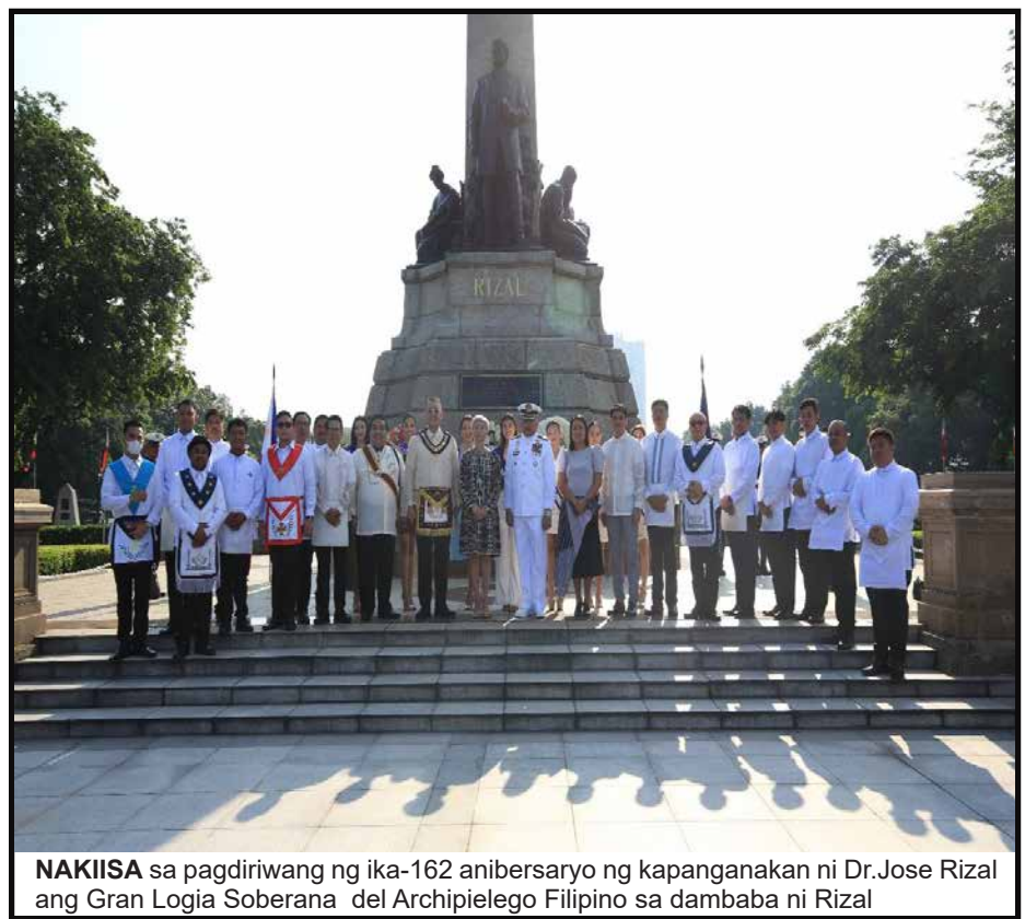
NAKIISA sa pagdiriwang ng ika-162 anibersaryo ng kapanganakan ni Dr. Jose Rizal ang Gran Logia Soberana del Archipielego Filipino sa dambaba ni Rizal