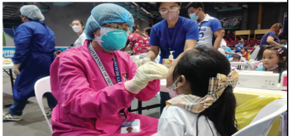
Dental Mission in the city of Imus---p.11

ACCEPTING ADS, PLEASE CALL: 0977-7844136/ 0968-7122927