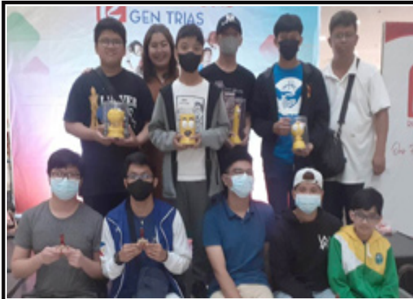
GROUP PHOTO 2ND ESNAJ FIDE STANDARD CHESS TOURNAMENT