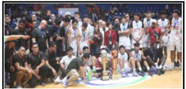
UP FIGHTING MAROONS CHAMPION FILOIL ECOOIL 16TH PRESEASON CUP