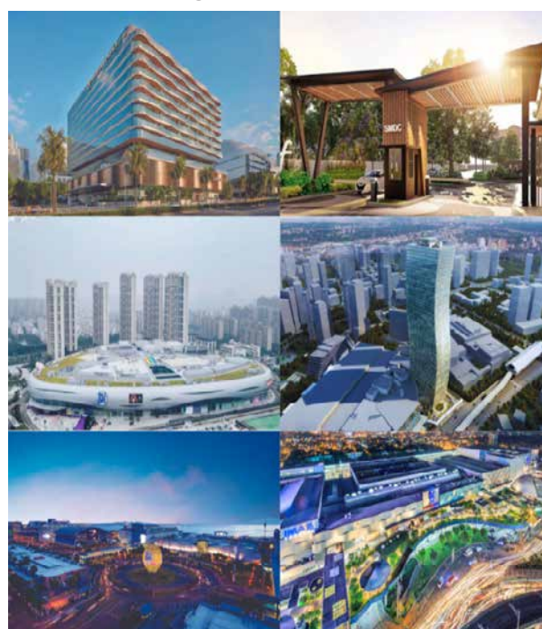
From Left to Right, Top to Bottom: Lanson Place, SM Development Corporation (SMDC) Turf Residences, SM City Yangzhou in China, SM Mega Tower, SM Mall of Asia Complex, and SM City North EDSA