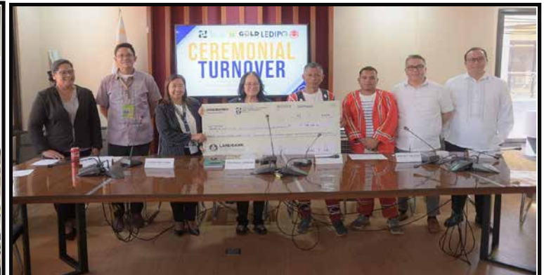
DOST, LGU Valencia grant tech upgrading support to IP coffee producers---story p.8

ACCEPTING ADS, PLEASE CALL: 0977-7844136/ 0968-7122927