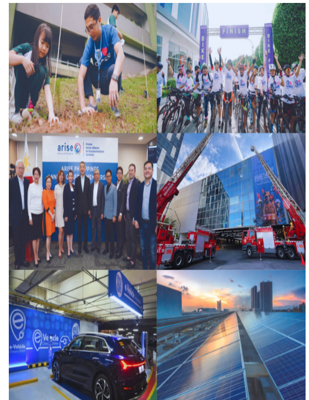
From Left to Right, Top to Bottom: SM Foundation's Grow Trees Community Program, SM Cares' Bike-Friendly Program, ARISE Philippines Chairperson Mr. Hans Sy and Members, SM Supermalls x Bureau of Fire Protection's (BFP) Nationwide Simultaneous Fire Drill, SM Supermalls' Electric Vehicle (EV) Charging Stations, and SM Prime's Solar Rooftop Project

SM Prime has always been committed towards creating a sustainable future. SM Prime continues to work towards its goal of achieving Net Zero carbon emissions by 2040, aligning with the Department of Energy's target of reaching a 35% renewable energy share by 2030. Through partnerships with renewable energy suppliers and organizations like the World Wildlife Fund for Nature (WWF), SM Prime endeavors to reduce its environmental footprint and advocate for sustainable practices in all areas of its operations.