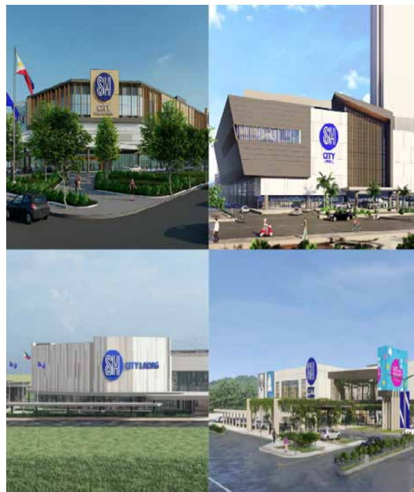
4 New SM Malls in 2024: SM City Caloocan, SM City J Mall, SM City Laoag, and SM City La Union

At the core of SM Prime's success is its unwavering commitment to shared prosperity in every city where they are present. With a strategic ₱100 billion investment capital expenditure in 2024, SM Prime aims to reinvest in its partners, stakeholders, and communities. SM Prime aims to continuously expand and develop new places for every Filipino to enjoy. 60% will be dedicated to enhancing its malls, development of new residential properties under SMDC, and construction of new hotels and convention centers. 40% will be directed towards acquiring new properties and coastal developments to pave the way for modern, eco-friendly urbanization.