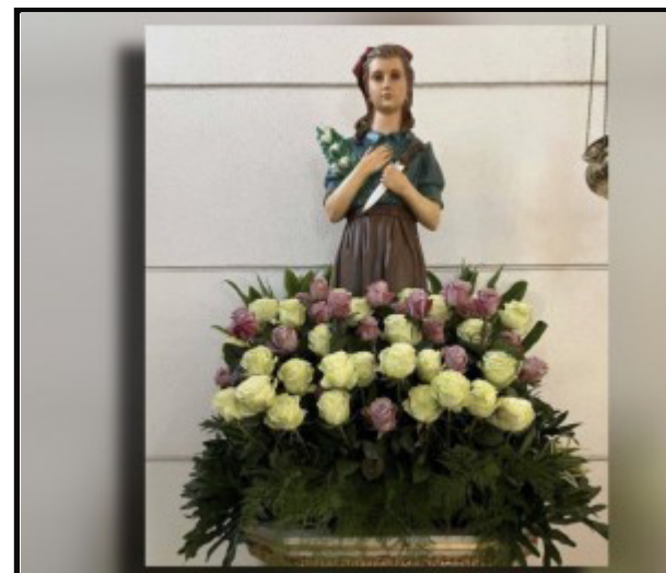
FORGIVENESS AND COMPASSION. Sta. Maria Goretti is the patron saint of chastity, poverty, purity, forgiveness, the youth, teenage girls, and victims of rape and abuse. The Sta. Maria Goretti Parish, located inside the Pope Pius XII Catholic Center on UN Avenue, Manila, was built in her honor. ---story p.11