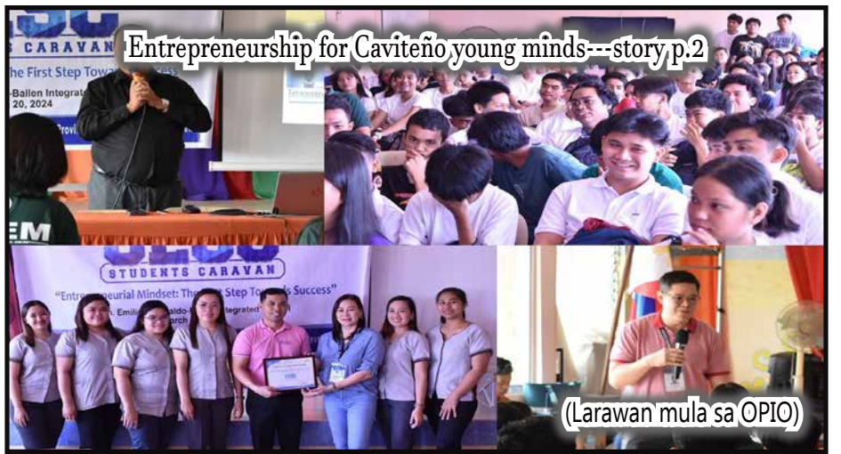
Entrepreneurship for Caviteño young minds---story p.2