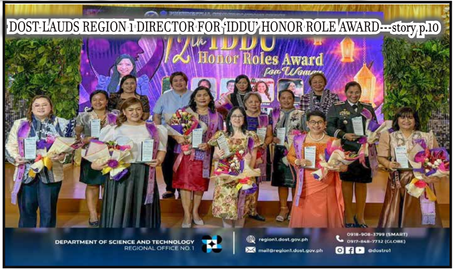
DOST-LAUDS REGION 1 DIRECTOR FOR 'IDDU' HONOR ROLE AWARD---story p.10

DEPARTMENT OF SCIENCE AND TECHNOLOGY REGIONAL OFFICE NO. 1 region1.dost.gov.ph 0918-908-3799 (SMART) 0917-848-7732 (GLOBE) mail@region1.dost.gov.ph @dost01