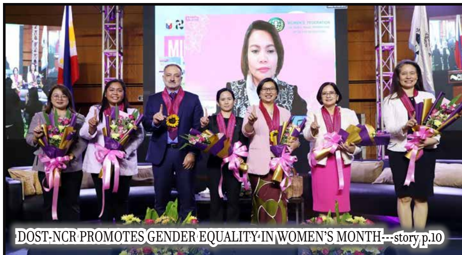
DOST-NCR PROMOTES GENDER EQUALITY IN WOMEN'S MONTH---story p.10

DEPARTMENT OF SCIENCE AND TECHNOLOGY REGIONAL OFFICE NO. 1 region1.dost.gov.ph 0918-908-3799 (SMART) 0917-848-7732 (GLOBE) mail@region1.dost.gov.ph @dost01