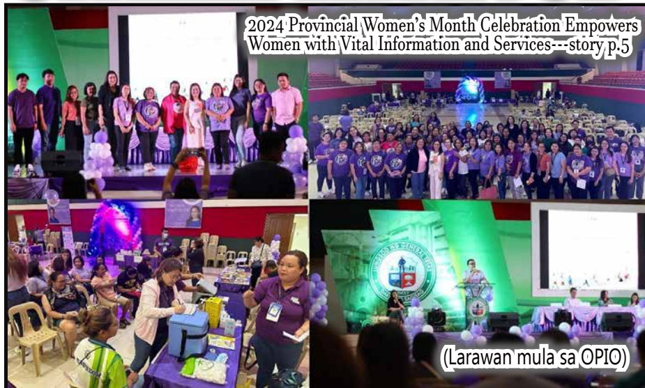
2024 Provincial Women's Month Celebration Empowers Women with Vital Information and Services---story p.5