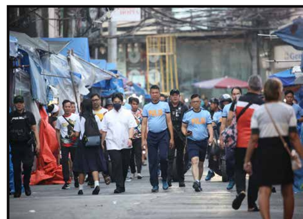
PARA sa kaligtasan ng mga deboto sa paggunita ngayong Semana Santa ay isinagawa kamakailan ang 'walk-through' na pinangunahan ng kaparian at mga tauhan ng Quiapo Church, mga miyembro ng Hijos del Nazareno, Manila Police District at Manila Department of Public Service sa paligid ng simbahan.