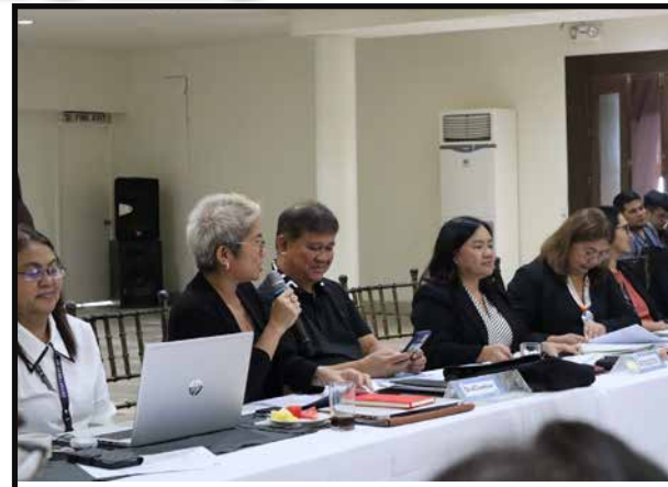
80 NorMin Regional RDI Committee members meets for 2024 plans, initiative---story p.6D

ACCEPTING ADS, PLEASE CALL: 0977-7844136/0968-7122927