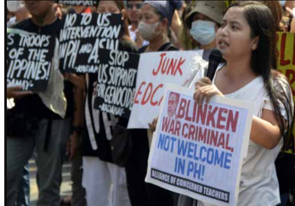
ANG iba't ibang militanteng grupo ay nagsama-sama sa pagkondena ng pagpasok at pakikialam ng mga tropang Amerikano kaugnay ng usapin at agawan ng teritoryo sa West Philippine Sea. Maagap naman na naagaw ng mga tauhan ng Manila Police District ang bandera ng America matapos tangkain ng mga militante na sunugin ito sa kanilang kilos protesta.

katutubong wika. Nakatakda itong idaos sa 9–11 Oktubre 2024 sa PNU Main Building Auditorium. Abangan ang mga pabatid para sa panawagan sa papel-pananaliksik at pagtanggap ng mga