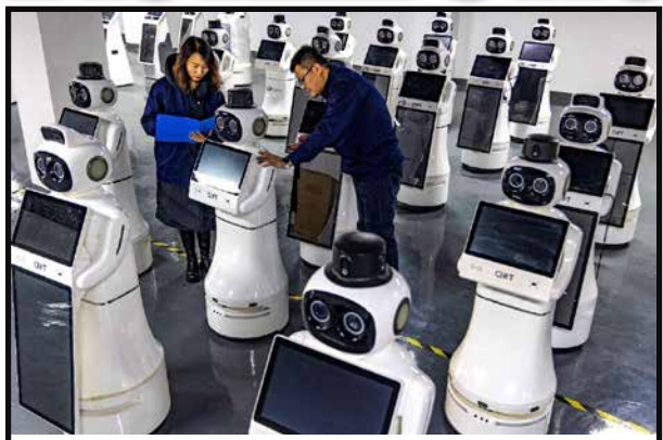
Technicians debug reception robots in a workshop of a tech firm in Zhangye, northwest China's Gansu province.