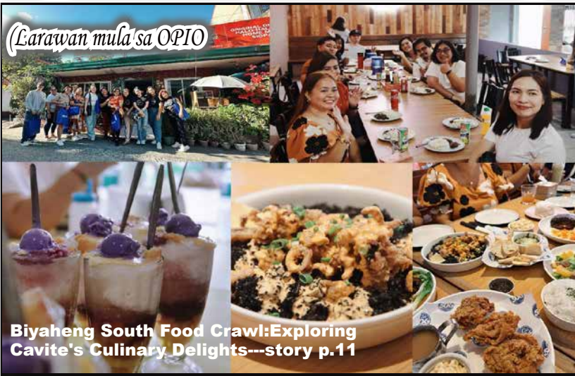
Biyaheng South Food Crawl: Exploring Cavite's Culinary Delights---story p.11