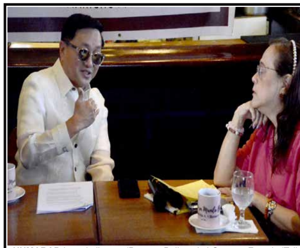
HUMARAP kamakailan sa 'Punong Balitaan' si Senator Francis 'Tol' Tolentino at binanggit ang pagkakapanalo ng ating bansa sa UNCLoS kaugnay ng kinasangkutan ng China sa pag-angkin at pagtatayo ng Artificial Island na pasok at pag-aari ng Pilipinas.