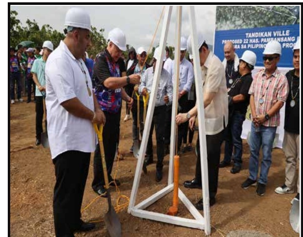
Ang groundbreaking ceremony and time capsule laying ng Pabahay para sa Pilipino Housing Program (4PH) noong Pebrero 16, 2024. --- story p.11