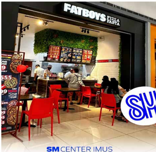
SM CENTER IMUS

SM CENTER IMUS, CAVITE - Indulge on a flavor-packed journey at Fat Boys Pizza Pasta where every slice and pasta twirl is a savory delight waiting to be discovered. It's not just a meal – it's an unforgettable culinary journey at Fat Boys Pizza Pasta!