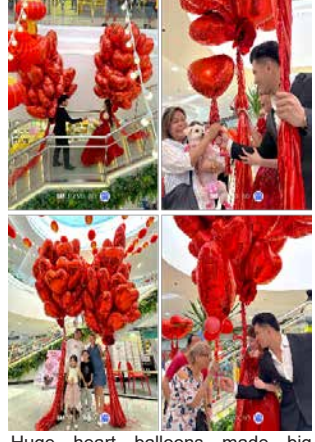
Huge heart balloons made e heart balloons made big beautiful smiles around SM and beautiful smiles around SM City Molino in the spirit of love and