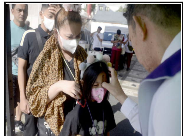
DINAGSA ng mga mananampalatayang katoliko ang National Shrine of the Black Nazarene, Quiapo Church nitong Ash Wednesday kasabay sa pagdiriwang ng Araw ng mga Puso.

The Office of the Provincial Governor-Medical Mission Team, in collaboration with the Office of the Provincial Health Officer, organized a Medical and Dental Mission in Barangay Bucal, Tanza on February 13, 2024.