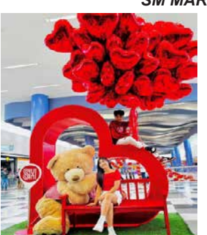
SM CITY TRECE MARTIRES