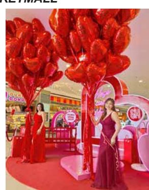
SM CITY DASMARINAS