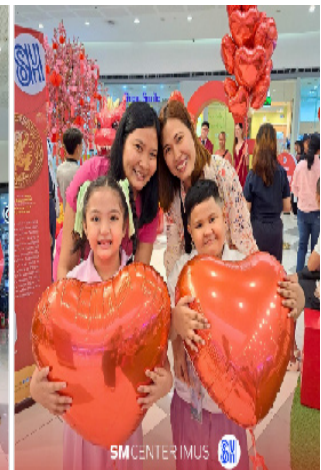
Double the hearts, double the love at SM Center Imus! Shoppers enjoy taking photos at the Valentines Display at SM Center Imus.