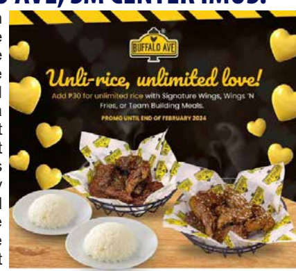
SM CENTER IMUS @

Indulge in an unlimited rice feast this Love month! Because nothing says 'I love you' like a full belly. Visit Buffalo Ave at SM Center Imus from February 14 to 28 and bring your love ones to share this wings that are to die for!