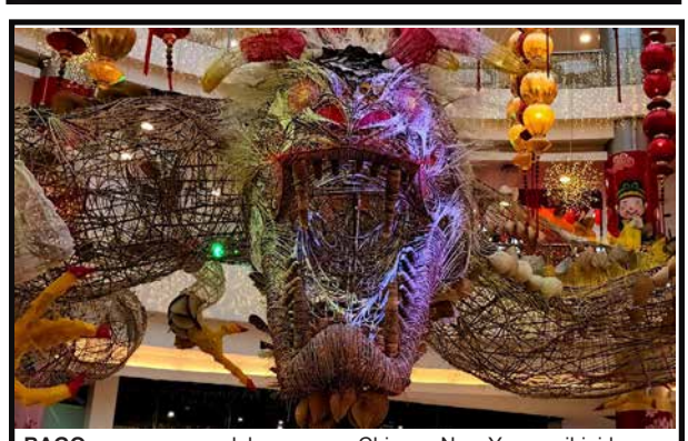
BAGO pa man ang selebrasyon ng Chinese New Year ay ibinida na ang malaking dragon na may habang 430-feet na gawa sa indigenous materials tulad ng abaka, kawayan, pawid, anahaw at ratan sa isang mall sa Maynila kasabay ng pagdiriwang ng ika- 430 anibersaryo ng pinakamatandang Chinatown sa buong mundo.

'Ika nga ay kung gusto ninyong mamatay kaagad o magpapakamatay ay 'wag mandamay pa.