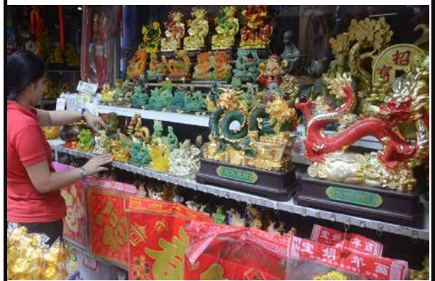
NAGING maganda ang bentahan ng mga panindang pinaniniwalaang pampaswerte na iba't ibang pigura ng wooden dragon sa Binondo, Maynila na kilala bilang old China town hindi lamang sa Pilipinas kundi maging sa buong mundo kaugnay sa paggunita ng Chinese New Year.