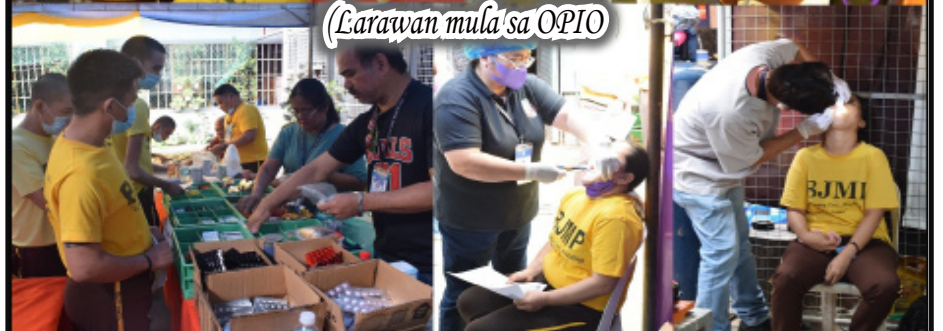
Bridging Health Gaps at Dasmariñas City Jail---story p.2

ACCEPTING ADS, PLEASE CALL: 0977-7844136/ 0968-7122927