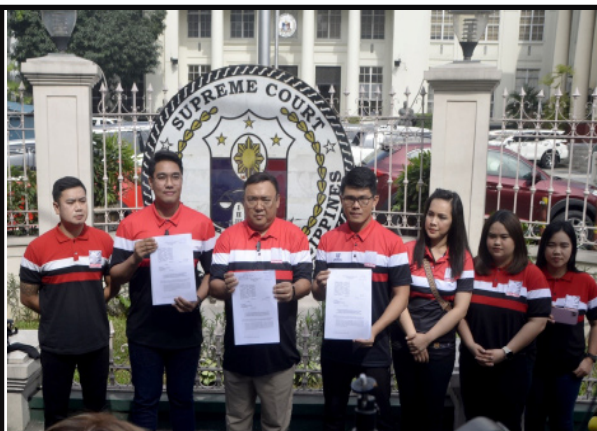
IPINAKITA nina dating Presidential Spokesperson Harry Roque kasama ang mga anchor at reporter ng SMNI ang inihang injunction order sa Korte Suprema upang ipatupad ang indefinite cease and desist order ng National Telecommunication Commission sa nasabing media network.