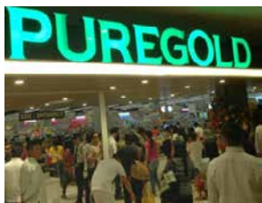
PUREGOLD MAASAHAN SA KALIDAD NA MABABANG PRESYO AT MAY KALIDAD PA SAN KA PA. TAYO NA

Labis na ikinatuwa ng mga netizens ang anunsyo ng Puregold nang mas pinababang presyo ng mga bilihin sa kanilang Facebook page. Marami ang nagsabi na malaking tulong ang diskuwento sa pagbabudget ng gastusin at pangdagdag kita sa paninda. Ipinahayag din ng mga netizen na hindi na nila kailangan magtiis sa mga brands na hindi kilala dahil quality pa rin ang hinahangad nila. "Sa totoo lang, mahirap mag-try ng iba lalo na 'pag 'di kilala o 'di alam kung saang galing," sabi ng isang netizen. "Iba rin kasi talaga 'pag trusted at kilalang brand. Tiwala ka sa quality, eh," pagsang-ayon ng isa. Madami ring mga Ka-Asenso ang