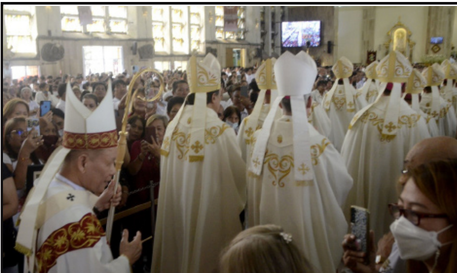
ANG pagdiriwang ng Soleme Declaration of Quiapo Church bilang isang National Shrine Minor Basilica and National Shrine of Jesus Nazaareno na pinangunahan ni Manila Archbishop Cardinal Jose Advincula at dinaluhan ng mga kaparian at arsobispo mula sa CBCP kasama si Manila Mayor Honey Lacuna at mga piling personalidad.