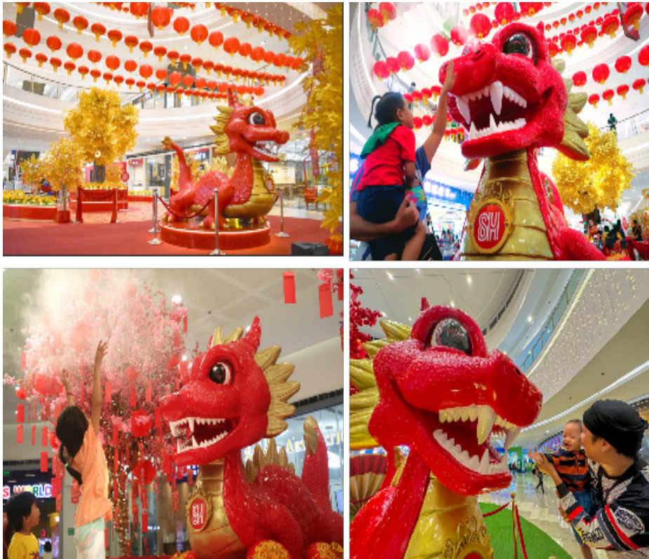
SM CITY BACOOR, SM CITY MOLINO, AND SM CENTER IMUS, CAVITE - SM City Bacoor, SM City Molino, and SM Center Imus are ushering in the Chinese New Year with a captivating celebration, embracing the Year of the Dragon with a dazzling display at their event centers. Shoppers are treated to a spectacular scene featuring a breathing dragon and a grand prosperity tree, symbolizing good fortune and abundance. SM City Bacoor stands out with its golden prosperity tree, adding an extra touch of lavishness to the festivities. The vibrant atmosphere and intricate decorations create a joyous ambiance, providing a delightful experience for visitors as they immerse themselves in the spirit of the Lunar New Year at these SM malls in Cavite.