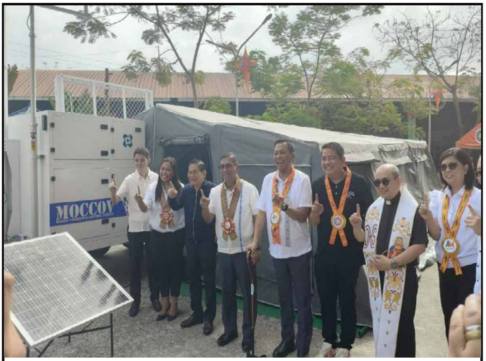
Caloocan gets mobile command center, DRR technologies from DOST---story p.3

ACCEPTING ADS, PLEASE CALL : 0977-7844136/ 0968-7122927