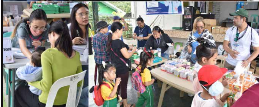
PGC extends health outreach program to the locals of Amadeo---story p.2