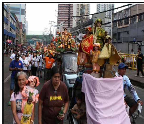
BAHAGI ito ng Lakbayaw Festival sa Tondo, Manila kaugnay sa pagpaparada ng mga imahe tuwing bisperas ng kapistahan ng Sto. Nino Pit Senior.