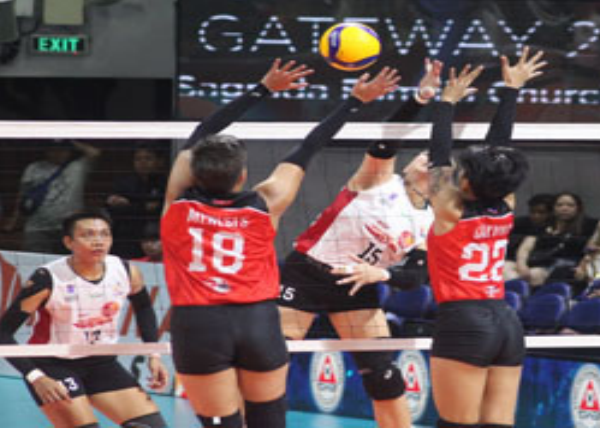
PVL PREMIER VOLLEYBALL LEAGUE IN AKSYON