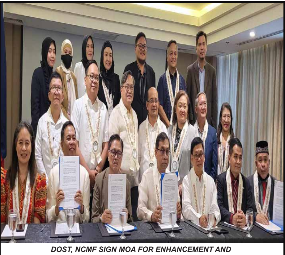
INTEGRITY OF HALAL PRODUCTS---story p.8