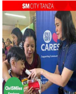
Happy kid receiving treats from SM City Tanza employee.