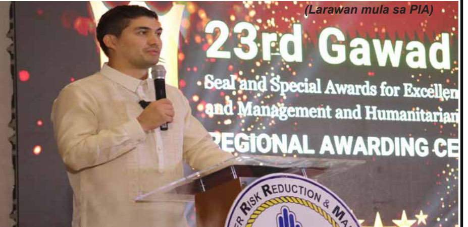
CALABARZON disaster response officers honored at 23rd Gawad KALASAG reg'l awards---story p.8

ACCEPTING ADS, PLEASE CALL: 0977-7844136/ 0968-7122927