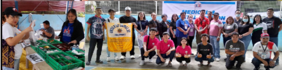
PGC extends Healthcare Services to Indang Community---story p.2