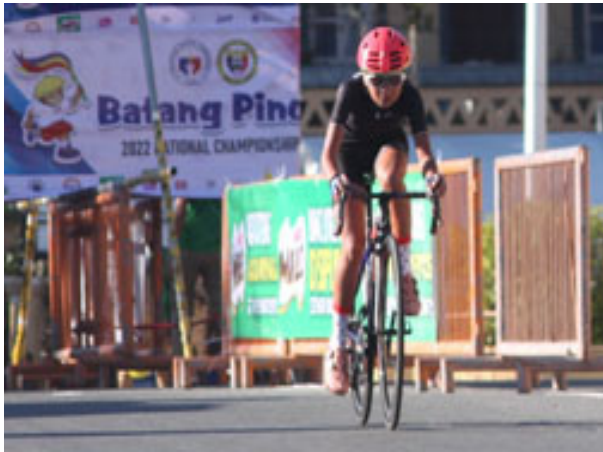
PhilCycling National Championships

Magiging bahagi ang ganitong postura ng pag arangkada ng kabataan kalahok sa cycling sa nakatakdang 2024 PhilCycling Nat'l Championships sa darating na Peb.5-9 sa Tagaytay.