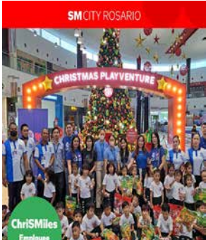
SM City Rosario employees and kids from Barangay Wawa III Child Development Center

SM malls in Cavite brought fun treats and happy day of games and surprises to children of various organizations in Cavite. This employee volunteerism program of SM called as 'chriSMiles' aims to involve SM employees in its goal to reach out to communities and give a small yet huge impact to the program's beneficiaries. SM City Dasmariñas in partnership with CSWDO-Dasmariñas City, gave treats to 63 children of Bahay Kalinga and Bahay Pagasa. SM City Tanza went to Amaya Elementary School, Tanza Cavite, catering SMiles to 40 children from (Special Needs Education) SNED Center. SM City Rosario invited to the mall 35 beneficiaries from Barangay Wawa III Child Development Center. And, SM City Trece Martires visited the Bukal ng Kapayapaan Home for Special Children with 32 beneficiaries.