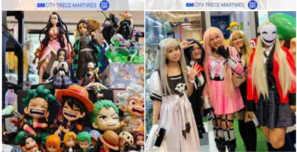
Toy enthusiasts and cosplayers gathered at SM City Trece Martires for the Toy Fest for all ages on December 25 to 30, 2023. Favorite collectibles from various animes, cartoons, and superheroes were displayed and exhibited while South Cosplayers showcased their cosplay and runway skills here at