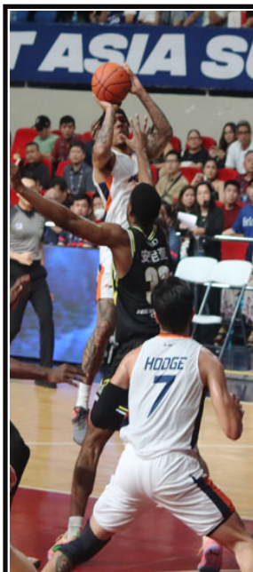
EAST ASIA SUPER LEAGUE MERALCO VS NEW TAIPEI KINGS

GANAP na handang handa na ang 2024 PhilCycling National Championships for Road na hatid ng Standard Insurance at ng MVP Sports Foundation na magaganap mula Pebrero 5 hanggang 9 sa Tagaytay City. Ang anunsyo ay pinahayag ni PhilCycling president Abraham "Bambol" Tolentino, na siya ring presidente ng Philippine Olympic Committee. Ang Top 30 riders sa Men Elite, Under 23, Juniors at Youth categories sa 2023 nationals noong Hunyo ay pipiliin habang ang women race ay bukas sa lahat ng interesadong rider sa limang araw na torneo na suportado ng Tagaytay City, Chooks to Go at Napakahusay na Noodles. Pinili rin ang Top 30 finishers sa Batang Pinoy-Philippine National Games na ginanap sa Tagaytay City at kalapit na una at ikatlong distrito ng Batangas nitong unang bahagi ng buwan. Ang PhilCycling ay nagtakda ng maximum na partisipasyon ng 90 riders sa individual road race (massed start) at 60 cyclists bawat isa sa criterium at individual time trial (ITT) sa Men's Elite, Under-23 at Juniors. Ang listahan ng entry ay ipopost sa Facebook page ng PhilCycling at mga social media platform. Kasama sa mga karera ng kababaihan ang indibidwal na karera sa kalsada, ITT at criterium para sa mga kategoryang Elite, Under-23 at Juniors, habang ang mga karera ng Kabataan ay sasaklaw lamang sa criterium at ITT.