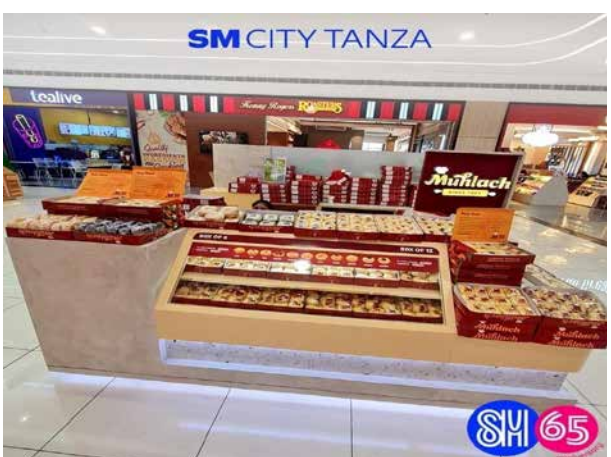
Bring home the newest sweet treat at SM City Tanza with the opening of Muhlach ensaymada! Visit its new store at ground floor in front of Kenny Rogers Roasters, and grab these perfect take aways for your family today!