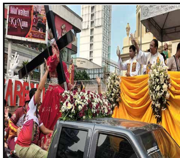
ILANG araw pa lamang bago ang mismong araw ng pista ng Black Nazarene ay dumagsa na ang mga replika ng Ilim na Poong Jesus Nazareno sa pagbabasbas ng kanilang mga imahe.

Magsilbing babala na lamang na maging alisto sa mga aso sa lansangan habang kayo ay nagmamaneho.