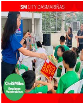
SM City Dasmariñas employee give school supplies to children of Bahay Kalinga, Dasmariñas City, Cavite.