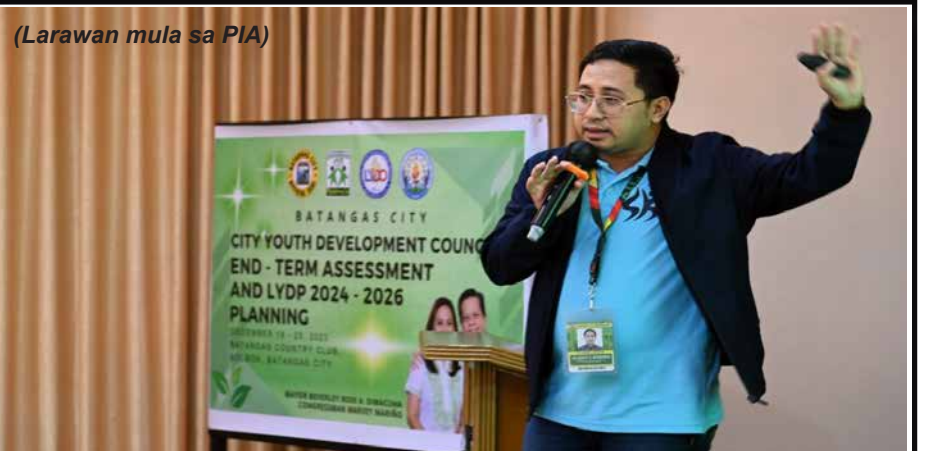
Pagbibigay proteksyon, pagsusulong sa kapakanan ng kabataan, sentro ng Batangas City youth dev't plan---story p.11