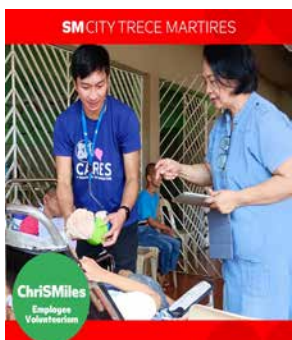
SM City Trece Martires' employee is handing SM Bears of Joy to a child from Bukal ng Kapayapaan Home for Special Children.