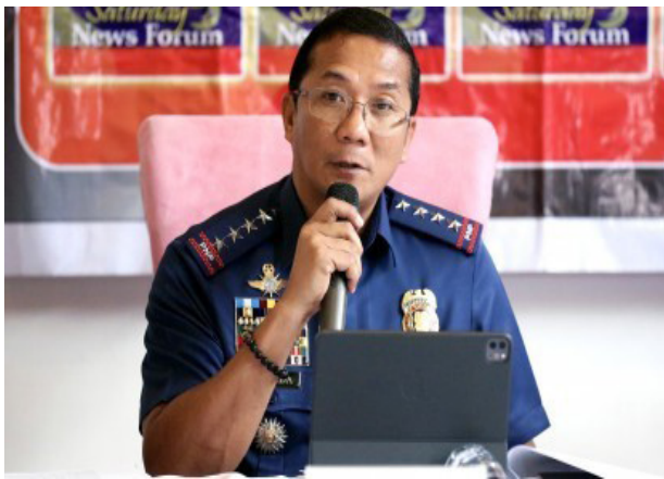
(PNA) PNP chief Gen. Benjamin Acorda Jr. (File photo)