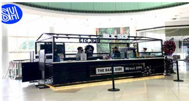
SM CITY DASMARIÑAS

After enjoying your lunch and dessert, shopping is what you need to do and while going around the mall or before going home carry a very healthy food that will set a good mood, grab a froyo at the first ever branch of BLK 513 in SM Malls in Cavite. Located at the upper ground floor near H&M.