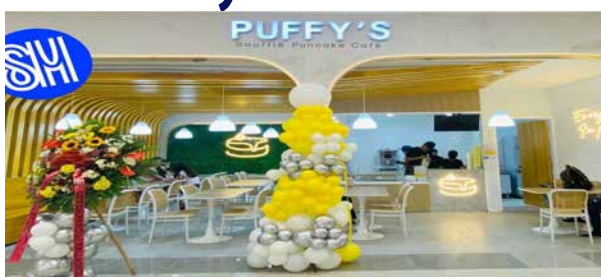
SM CITY DASMARIÑAS

Lunch at Out of Nowhere was really a not-your-ordinary meal of the day and it is nice to also have some not-your-ordinary dessert at Puffy's Souffle Pancake Café at the lower ground floor.