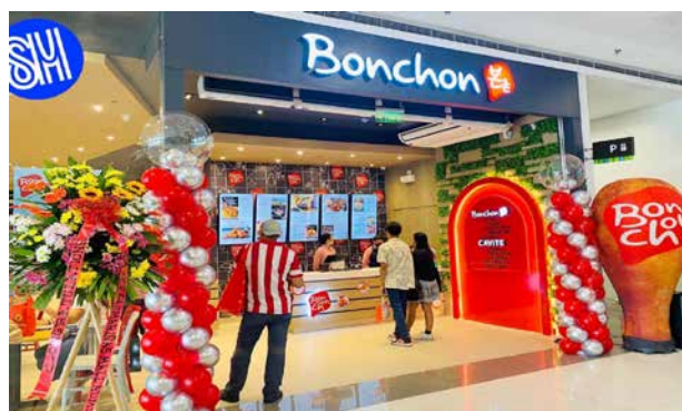
SM CITY DASMARIÑAS

No other fun way to spend holiday but eating, right? SM City Dasmariñas got you with its newest food stops of different food choices that will surely make you stay for the whole day! Spend your brunch at Bonchon SM City Dasmariñas and satisfy your Korean chicken cravings! Located at the lower ground floor.