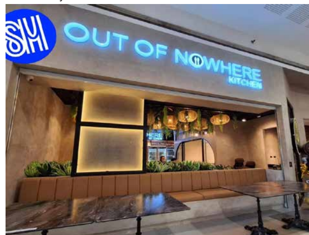
SM CITY DASMARIÑAS

After a quick run at the mall for some errands, make a stop for lunch at Out of Nowhere Kitchen at the lower ground floor for a wider variety of food choices.