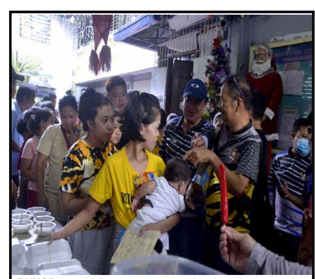
BUKOD sa mainit na sopas ay naghandog din ng munting tulong at regalo sa nasa 300 pamilyang biktima ng sunog sa Tondo Happy Land ang Buklod at Alyansa ng mga Nagkakaisang Anak ng Tundo o BANAT.

Another project is NICER or Niche Centers in the Regions for R&D. DOST has lot of other projects in every region.