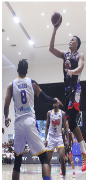
MPBL REGULAR SEASON CHAMPIONSHIP PAMPANGA GIANT LANTERN CHAMPION VS BACOUR CITY STRIKERS