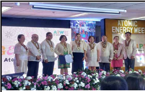
The wait is over as the 51st Atomic Energy Week was launched. Here are glimpses of the opening ceremony of the Atomic Energy Week happening at DOST - Philippine Nuclear Research Institute. The said event will run for four days, showcasing the advancements of nuclear science and cutting-edge research. Overall, the first day sets the stage for addressing messages, the official launch of the 1st Philippine Nuclear Science Olympiad, formal commencement, and general promotion activities to increase awareness and understanding of atomic energy.---story p.11