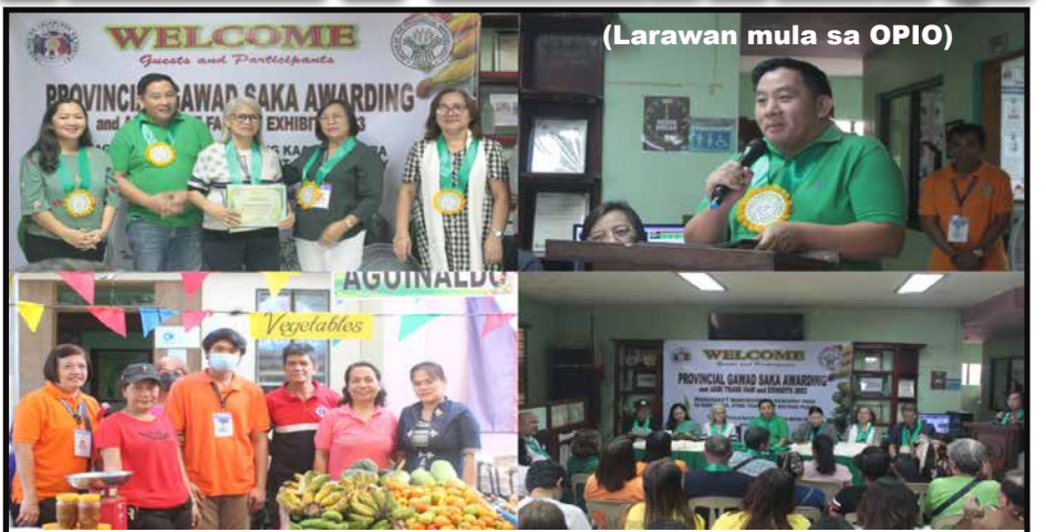
Gawad Saka---story p.11