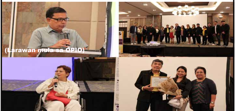
Empowering Possibilities: Persons with Disabilities (PWDs) Entrepreneurs, Overcoming Challenges and Achieving Success---story p.2

ACCEPTING ADS, PLEASE CALL: 0977-7844136/ 0968-7122927