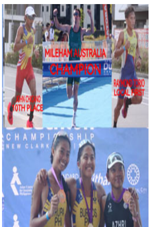
2023 ASIA TRIATHLON DUATHLON CHAMPIONSHIPS MEN AND WOMEN'S STANDARD ELITE