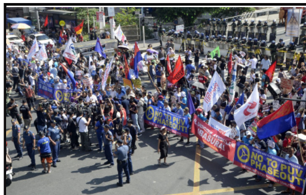
KILOS -protesta ito ng iba't ibang militanteng grupo sa paanan ng tulay ng Mendiola sa Maynila kasabay ng ikinakasang extended transport strike ng PISTON at Manibela kaugnay sa isyu ng jeepney modernization program.