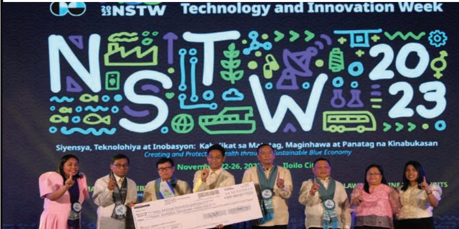
DOST HOLDS 2023 NATIONAL SCIENCE TECHNOLOGY AND INNOVATION WEEK IN ILOILO CITY---story p.11