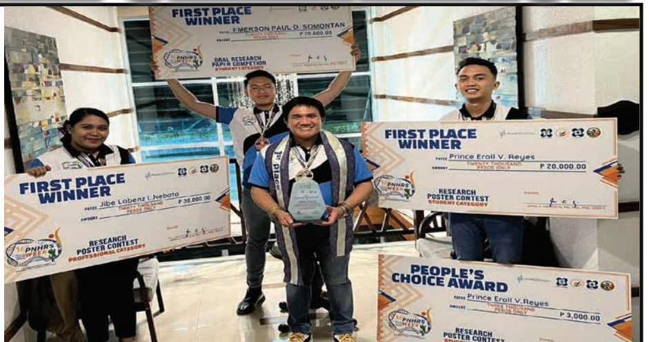
NorthMin health researchers secure four wins at the 16th PNHRs Week Celebration---story p.3