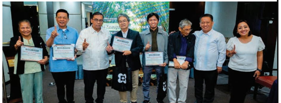
DOST highlights growing bamboo as a strategy to Climate Change Adaptation and Sustainability---story p.10

ACCEPTING ADS, PLEASE CALL: 0977-7844136/ 0968-7122927