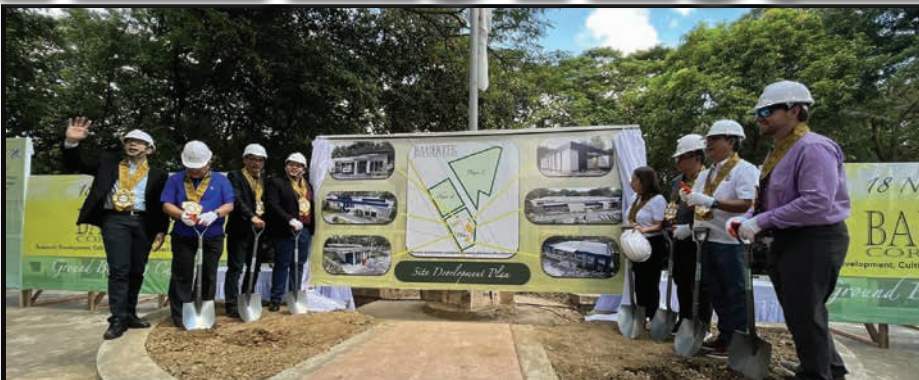
BAUERTEK CORPORATION BREAKS GROUND FOR NEW FACILITY IN CLSU---story p.3