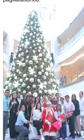
STA CLAWS MEET AND

ldinaos ang magkakahiwalay na indoor tree-lighting event mula sa Ali Mall, hanggang Gateway Mall, at Farmers Plaza, ayon sa pagkakasunod.