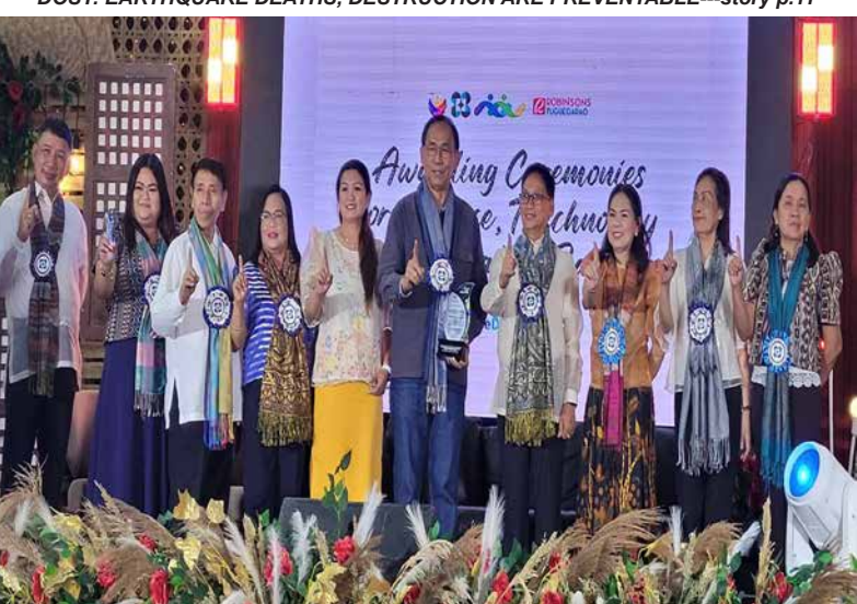
OOST CELEBRATES 2023 REGIONAL SCIENCE WEEK IN CAGAYAN VALLEY---story p.11