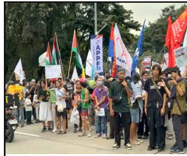
IBA'T IBANG militanteng grupo na karamahian ay mga kabataan ang nagmartsa patungong U.S. Embassy kaugnay ng panawagn at pagkondena sa pagsuporta ng Estados Unidos sa Genocide laban sa mga Palestino gayundin ang pagtuligsa sa war games na ginagawa ng Amerika at pagpapalawak ng impluwensyang militar sa buong Asia.