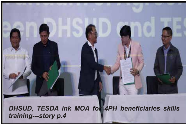
DHSUD, TESDA ink MOA for 4PH beneficiaries skills training ---story p.4