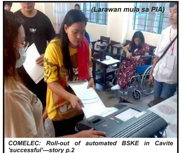
COMELEC: Roll-out of automated BSKE in Cavite 'successful' ---story p.2

ACCEPTING ADS, PLEASE CALL: 0977-7844136/ 0968-7122927