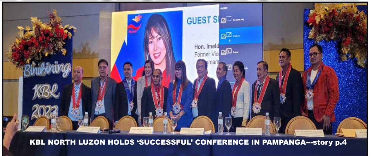
KBL NORTH LUZON HOLDS 'SUCCESSFUL' CONFERENCE IN PAMPANGA ---story p.4