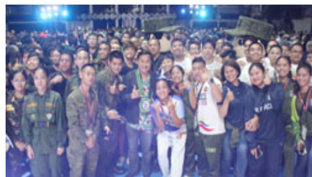
ROTC NATIONAL GAMES CHAMPIONSHIP CLOSING CEREMONY SENATOR FRANCIS TOLENTINO JOIN WITH CADETS