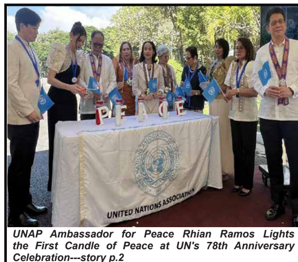
UNAP Ambassador for Peace Rhian Ramos Lights the First Candle of Peace at UN's 78th Anniversary Celebration ---story p.2