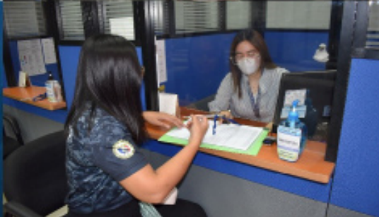
Benchmarking Activity of Ilocos Sur Provincial Jail at Cavite Provincial Jail---story p.2