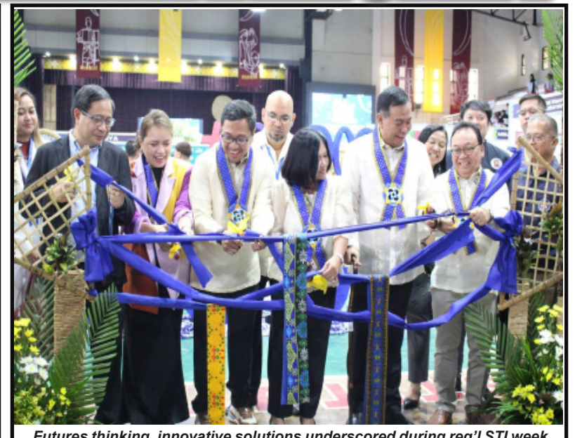
Futures thinking, innovative solutions underscored during reg'l STI week in Iligan---story p.4

ACCEPTING ADS, PLEASE CALL: 0977-7844136/ 0968-7122927