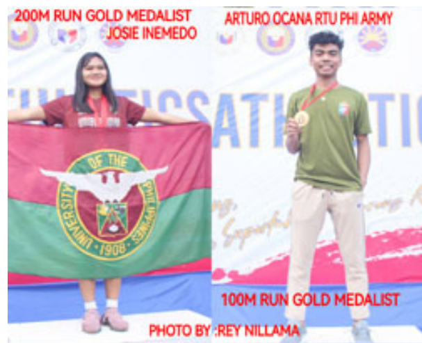
ROTC NATIONAL GAMES ATHLETICS CHAMPIONSHIPS GOLD MEDALIST