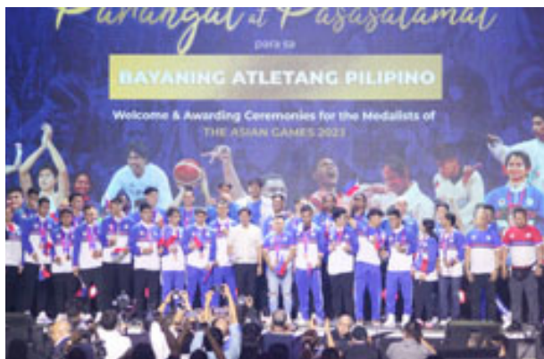
PARANGAL AT PASASALAMAT SA BAYANING ATLETANG PILIPINO

MAKARAANG pagkalooban ng incentive ng Pangulong Ferdinand Marcos Jr. Sa ginanap na "Parangal at Pasasalamat sa Bayaning Atletang Pilipino" sa Rizal Memorial Sports Complex, Malate Manila ang mga atletang sumabak sa katatapos na Sea Games sa Hangzhou China kung saan nag uwi ng karangalan sa bansa kabilang ang koponan ng Gilas Pilipinas, Boxing Eumer Marcial, Sipak Takraw, Tennis, Ej Obiena ng Athletics at iba pa kung saan ay nag photo ops.