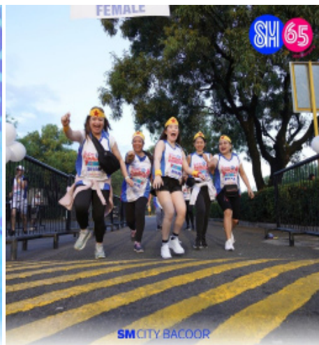
The participants wore costumes to make the event even more fun. An energetic Zumba session followed to keep up with the energy of the tireless runners after the track run.