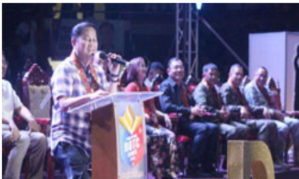
Senator Francis Tolentino Philippine ROTC National Games Championship opening ceremony

Matapos ang makulay na opening ceremony nadin aluhan ni Presidential Adviser on Peace, Reconciliation and Unity Carlito Galvez Jr. ay papagitna ang mga finals sa athletics sa Philsports Track Oval sa Pasig City.