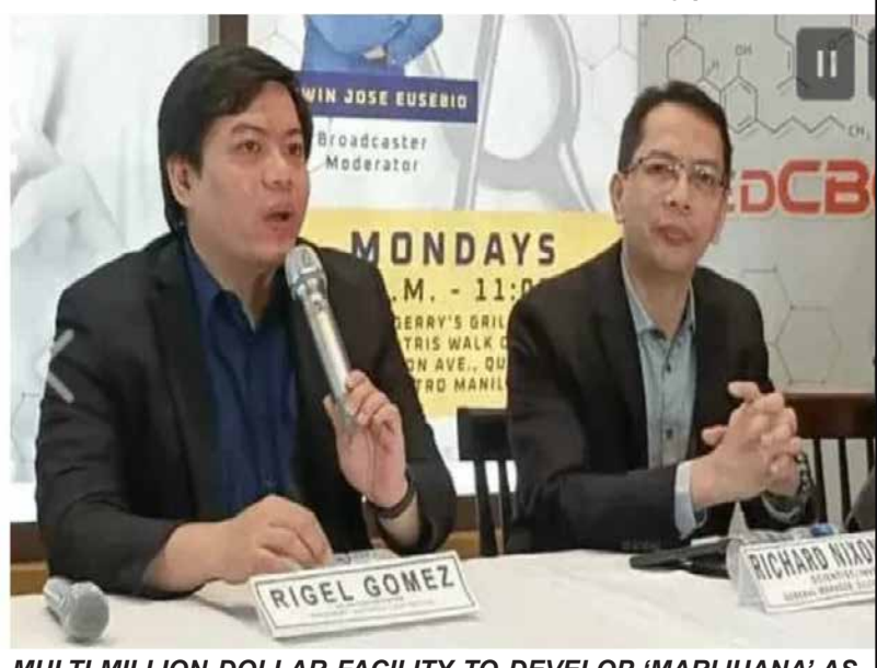
MULTI-MILLION DOLLAR FACILITY TO DEVELOP 'MARIJUANA' AS MEDICINE TO BE BUILT SOON---story p.2

ACCEPTING ADS, PLEASE CALL: 0977-7844136/0968-7122927