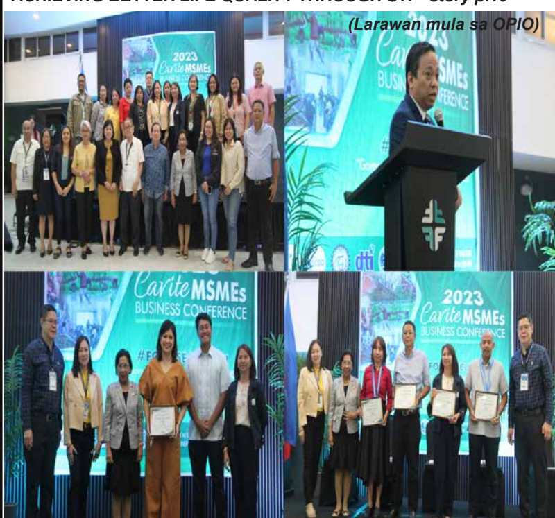
Cavite MSMEs Business Conference---story p.2