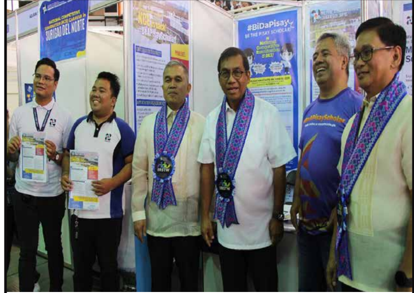
ACHIEVING BETTER LIFE QUALITY THROUGH STI---story p.10