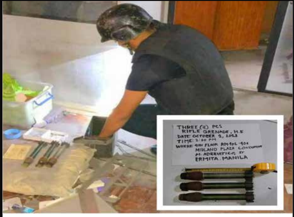
TATLONG riffle grenade ang natagpuan sa room 902-904, 9th floor Midland Plaza Condominium sa Adriatico Ermita Manila bandang 2:30 ng hapon nitong Oktubre 2. CHRISTIAN HERAMIS

Ša Cavite nga ay halos dalawang magkasunod na ganitong insidente ang nangyari.