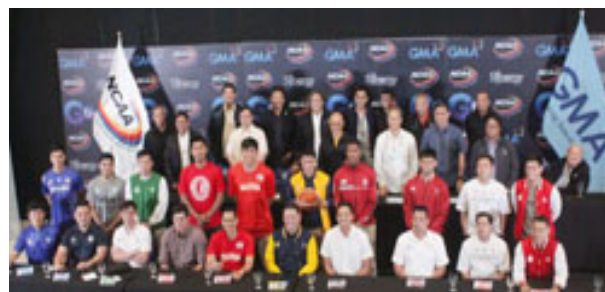
NCAA SEASON 99 GROUP PHOTO OPS