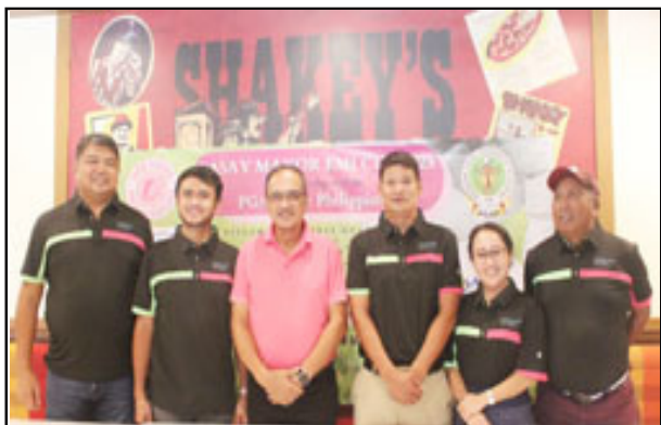
PASAY MAYOR EMI CUP 2023 GROUP PHOTO

Magtagumpay kaya ang Letran Knights para sa pangarap nilang four-peat? May mababago kaya sa CSB Blazers? O isang bagong unibersidad ang maghahari sa paligsahan ngayong taon? Magkaganun man, panigurado, sa kasabangan ang mga panatiko sa larangan ng basketball at tiyak na kasasabikan ng bayang basketballista ang mga aksyon sa NCAA Season 99 "New Heroes of the Game".