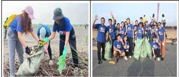
The shores of Cagayan River get cleaned by volunteers from SM City Tuguegarao & SM Center Tuguegarao Downtown