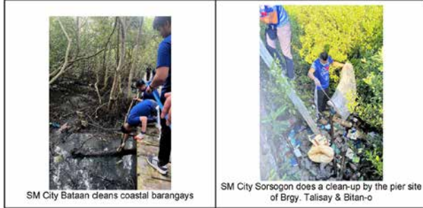
SM City Bataan cleans coastal barangays

15 SM malls in 12 locations nationwide partnered with the DENR, LGUs and communities to collect 100,432.50 kg of trash