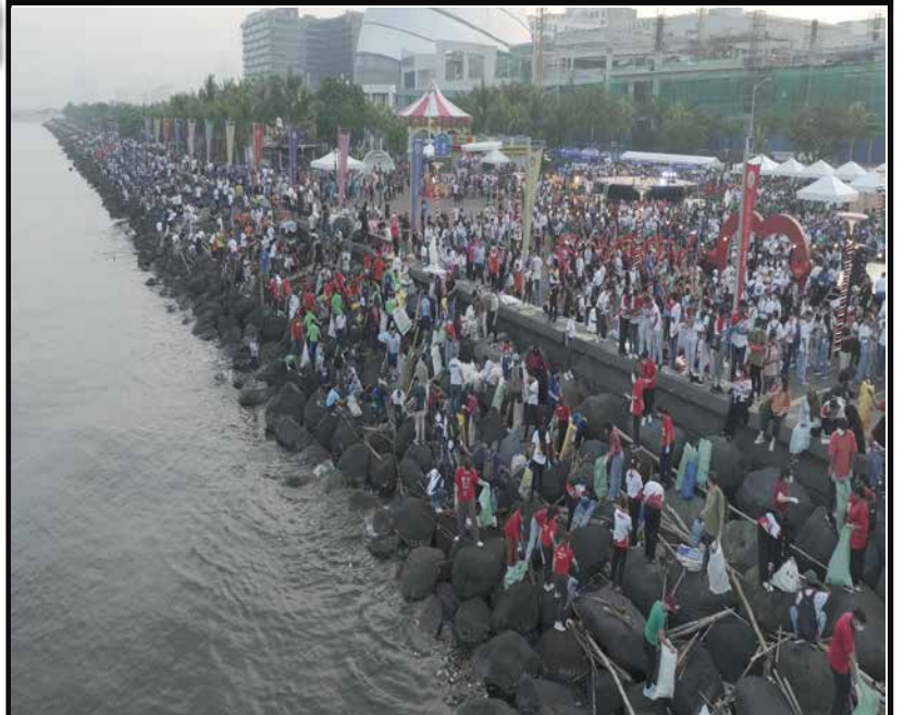
SM Supermalls has participated in the International Coastal Clean Up since 2015, becoming an avenue for volunteers to work together towards a cleaner, greener future.

ACCEPTING ADS, PLEASE CALL: 0977-7844136/ 0968-7122927