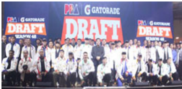
79 PICK PBA 48TH SEASON ROOKIE DRAFT @AYALA MALLS MARKET MARKET TAGUIG CITY