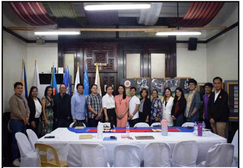
Forum sa Gramatikang Filipino, Isinagawa ng KWF---istoriya sa p.11