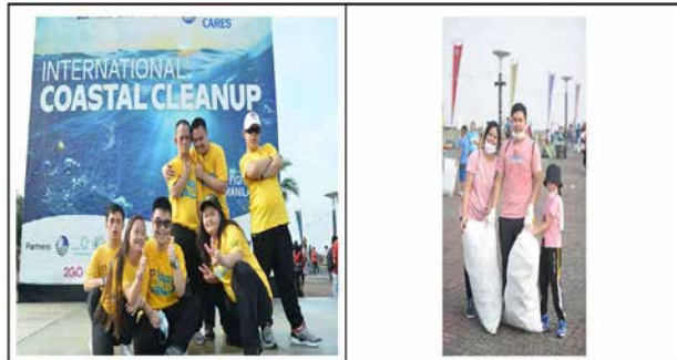
Gathering over 17,000 volunteers from various sectors, coastal clean-ups are part of SM Cares advocacies that champion social inclusion and care for the environment.