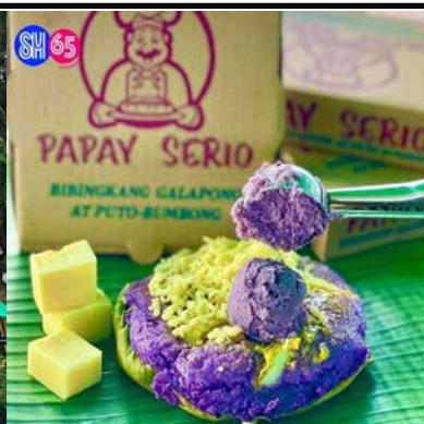
SM CITY TRECE MARTIRES

The home of the Best Bibrangang Galapong and Puto Bumbong is now at SM City Trece Martires! Visit Papay Serio at SM City Trece Martires Transpot Hub and try their all-time favorite desserts and bring home the joys of Christmas to your loved ones today!