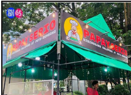
SM CITY TRECE MARTIRES