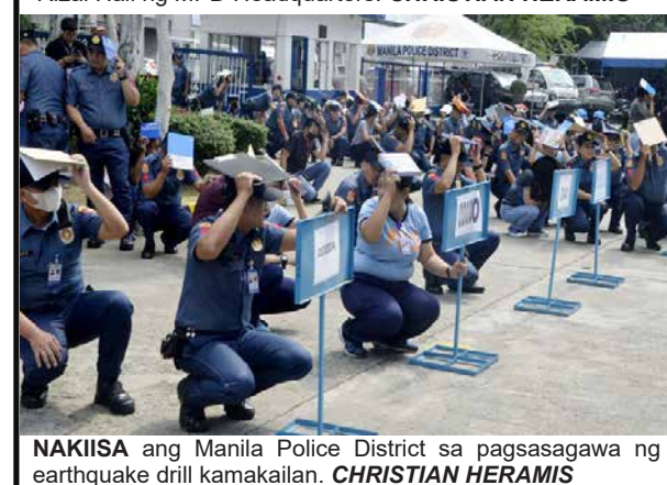
NAKIISA ang Manila Police District sa pagsasagawa ng earthquake drill kamakailan.