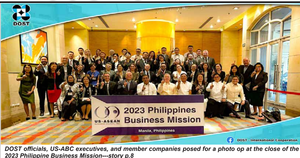
DOST officials, US-ABC executives, and member companies posed for a photo op at the close of the 2023 Philippine Business Mission---story p.8