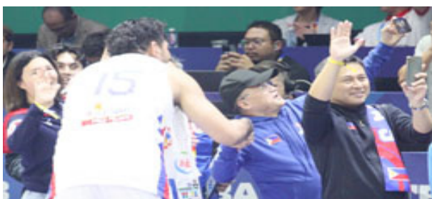
SELFIE SENATOR CHRISTOPHER LAWRENCE BONG GO WITH KAI SOTTO