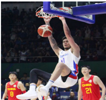
SLAMDUNK GILAS PILIPINAS KAI SOTTO VS CHINA IN YOUR FACE - Humagibis sa bilis ng pag slamdunk si Gilas Pilipinas center Kai Sotto habang di naka pormaangdalawang katunggaling China player ng magharap sila sa FIBA Basketball World Cup 2023 sa Smart Araneta Coliseum. Tinambakan ng Gilas ang China sa iskor na 96 - 73.