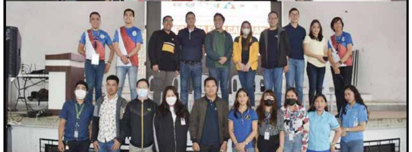
Job opportunities for Silangeños---p.2

ACCEPTING ADS, PLEASE CALL: 0977-7844136/ 0968-7122927