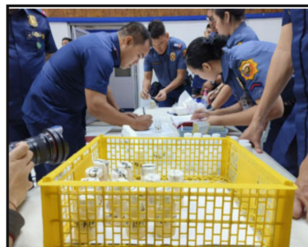
ISINAGAWA ang sorpresang drug test sa hanay ng mga opisyal at tauhan ng Manila Police District kamakailan sa Rizal Hall ng MPD Headquarters.

Hindi na rin natin dapat pang talakayin ang problema tungkol sa bigas dahil batid naman po ninyo ito. Kumbaga ay tukoy naman na ang ugat ng suliranin hinggil dito ay nararapat lamang ng tunay na solusyon. Kung paaano ay dapat alam ito ng mga eksperto o ng mga nakapuwesto na may kinalaman sa usaping bigas o sa palay. Kung ito ay hindi mabibigyan ng angkop na kasagutan ay para saan pa ang kasabihang ang bawat problema ay may kaakibat na solusyon. Tamang kasagutan ang hanap ng taumbayan sa problema sa isyu ng bigas.