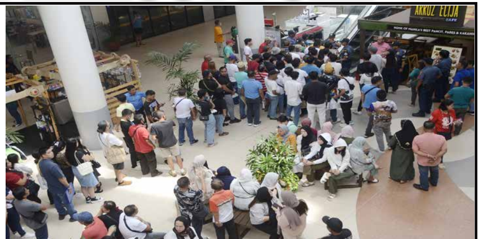
DAGSA sa Robinsons Otis Mall ang mga naghain ng Certificate of Candidacy para sa Barangay at Sangguniang Kabataan Election 2023 sa Oktubre sa unang araw ng pagpapatala nitong Agosto 28.

ACCEPTING ADS, PLEASE CALL: 0977-7844136/ 0968-7122927