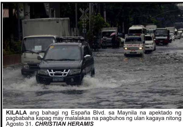
KILALA ang bahagi ng España Blvd. sa Maynila na apektado ng pagbabaha kapag may malalakas na pagbuhos ng ulan kagaya nitong Agosto 31.

Lumilitaw na kahit nakainom umano ng alak ay nakuha pang lumangoy ng dagat ang biktima na ikinalunod nito. Sinikap naman ng mga kawani ng Bantay Dagat mula sa Barangay Payak, Bato na isalba ang biktima. Tumulong din ang mga tauhan ng Coast Guard mula sa Balatan, Camarines Sur. MARCK BADION