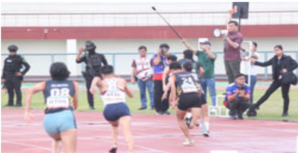
ROTC GAMES GUN START OVERALL CHAIRMAN ROTC GAMES SENATOR FRANCIS 'TOL' TOLENTINO