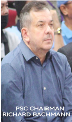
PSC CHAIRMAN RICHARD BACHMANN