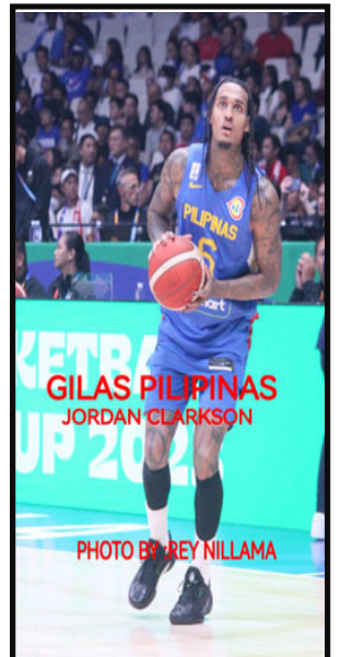
GILAS PILIPINAS JORDAN CLARKSON Bukod tanging nanguna sa puntos si Jordan Clarkson ng 24 points para sa Gilas Pilipinas sa kanilang pakikipag tagisan sa katunggaling South Sudan na nagwagi sa iskor na 87 - 68 sa ginanap na FIBA World Cup 2023 sa Araneta Coliseum