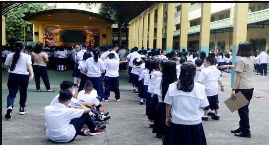
ILAN lamang ito sa mga eksena sa unang araw ng 'Balik-Eskwela' sa Justo Lukban Elementary sa Maynila.