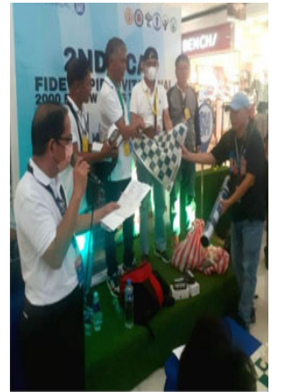
CHESS MATERIALS TURN OVER FROM SCAP