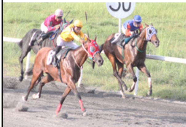
RBHS Class 4 stake race 13 Sonic Clay winner