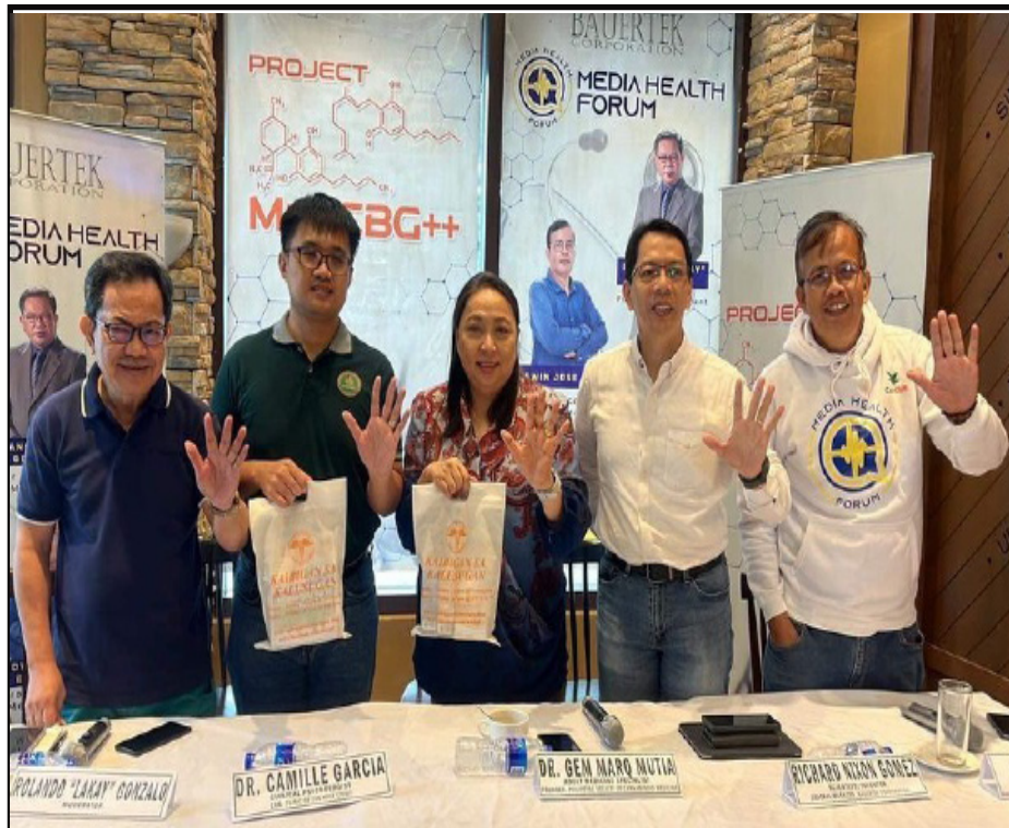
DOH RECOGNIZES 'MARIJUANA' BENEFITS---p.5