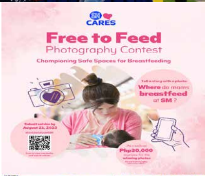
The SM Cares Free to Feed photo contest invites photo enthusiasts and mothers to capture their breastfeeding moment anywhere within SM Supermalls.

For more information, please visit www.smsupermalls.com/smcares or follow SM Cares on www.facebook.com/OfficialSMCares