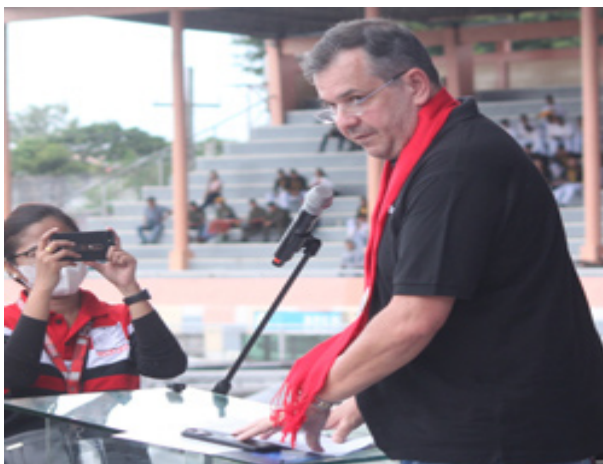
RICHARD BACHMANN PSC CHAIRMAN ROTC GAMES OPENING MESSAGE

ng ating mga magiging lider," sabi ni Philippine Sports Commission chair Richard Bachmann sa kanyang talumpati. "Habang nasasaksihan natin ang ating mga kadete na nakikipagkumpitensya sa pinakamataas na antas ng paglalaro, dapat nating matanto na hindi lamang ito pagpapakita ng kanilang pisikal na husay at liksi sa pag-iisip, kundi isang pagpapakita rin ng kanilang pangako sa pagpapabuti ng ating lipunan -- isang pangako na sumasalamin nang malalim sa mga prinsipyo ng programa ng ROTC." Sinabi ni Bachmann na ang layunin ng ROTC ay itanim ang mga pagpapahalaga na magiging kapakipakinabang sa buhay ng mga estudyante. "Ang ROTC Games ay hindi lang tungkol sa kompetisyon. Kinapapalooban nila ang mga pagpapahalagang itinanim ng programa ng ROTC sa ating kabataan at sa susunod na henerasyon. Ang mga mithiin ng pamumuno, pakikipagkapwa at paglilingkod sa bayan ay ipinakitangmagkalahakihan at kababaihan na masigasig na nagsanay upang makipagkumpitensya sa antas na ito," aniya.