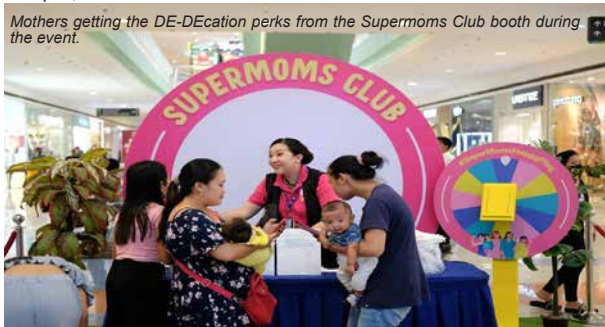
Mothers getting the DE-DEcation perks from the Supermoms Club booth during the event.

SM Supermalls provides accessible and safe spaces for nursing mothers through 80 breastfeeding stations available for customers and employees across SM malls nationwide. Earlier this month, SM Cares kicked off World Breastfeeding Week with sensitivity trainings for frontliners conducted by SM Mall Nurses to help create a welcoming environment for breastfeeding mothers. Dedicating Perks are also available for mothers visiting breastfeeding stations in partnership with Baby Company, Watsons, Cetaphil, Dove and Sansfluo.