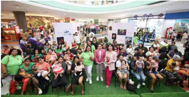
Mothers from Dasmariñas Green Ladies and partners from the public and private sector join hands with SM Cares in advocating for safe spaces for breastfeeding mothers with the Free to Feed photo exhibit and forum at (Mall Name)

In celebration of National Breastfeeding Month this August, SM Cares continues to promote breastfeeding awareness by mounting the "Free to Feed: Championing Safe Spaces for Breastfeeding at SM" forum and photo exhibit roadshow, launched at SM City Dasmariñas last August 16, 2023, together with Provincial Nutrition Office, Dasmariñas City Health Office and Dasmariñas Green Ladies.