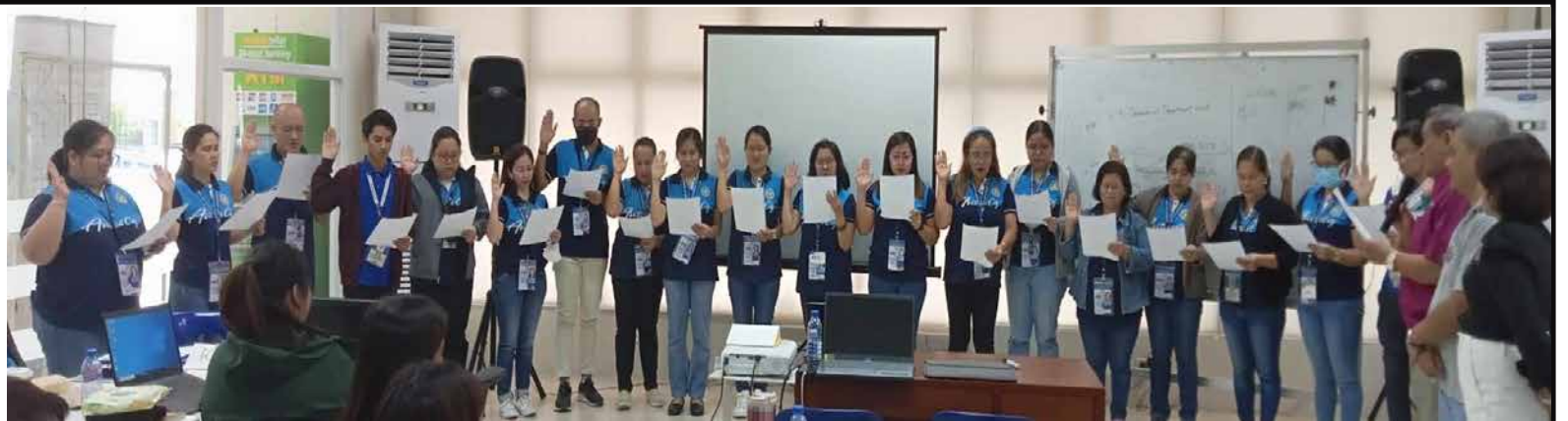
PGI's Graduation Ceremony---p.2