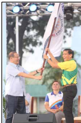
MARIKINA CITY MAYOR MARCY TEODORO TRANSFER HOST FLAG TO CEBU CITY MAYOR MIKE RAMA NEXT PB 2024 HOST

Sinariwa pa ni De Vera na may magandang hangarin pa ang nalalapit na pag - apruba para sa mandatory ROTC sa mataas na edukasyon matatadaang pagpasa ng house bill 6687 o ang sinasabing National Citizen Service Training sa Kongreso.