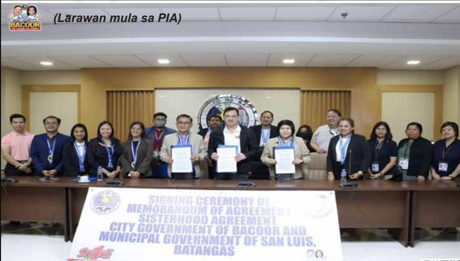
Kooperasyon ng Bacoor City, San Luis, Batangas LGUs sa paghahatid ng serbisyo, pinagtibay---p.2