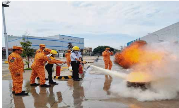
SM City Tanza employees were taught by BFP Tanza how to properly use fire extinguisher.

SM Supermalls continue to improve and to enhance its safety measures and processes for a more safe mallng experience.