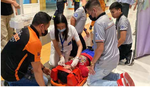
SM Emergency response team of SM City Rosario gave first aid to the fire drill casualty.

SM employees and mall tenants participated recently in the nationwide fire drill on high density occupancies at SM City Tanza and Rosario. In partnership with the Bureau of Fire protection, the drill aims to teach and to prepare employees the right procedures to evacuate, to use fire tools and equipment and to give first aid during fire incidences.