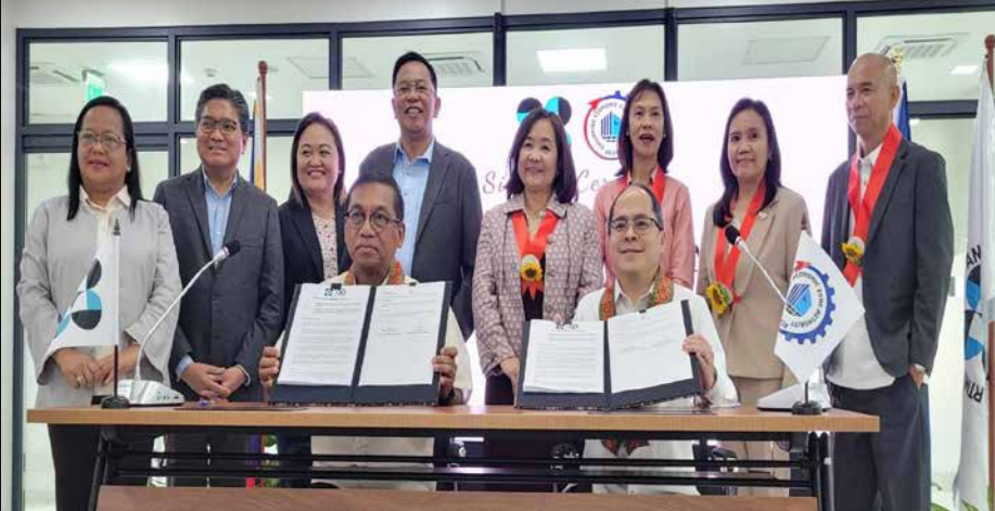
DOST, PEZA SIGN JOINT MEMO CIRCULAR TO ESTABLISH K.I.S.T ECOZONES---p.6D