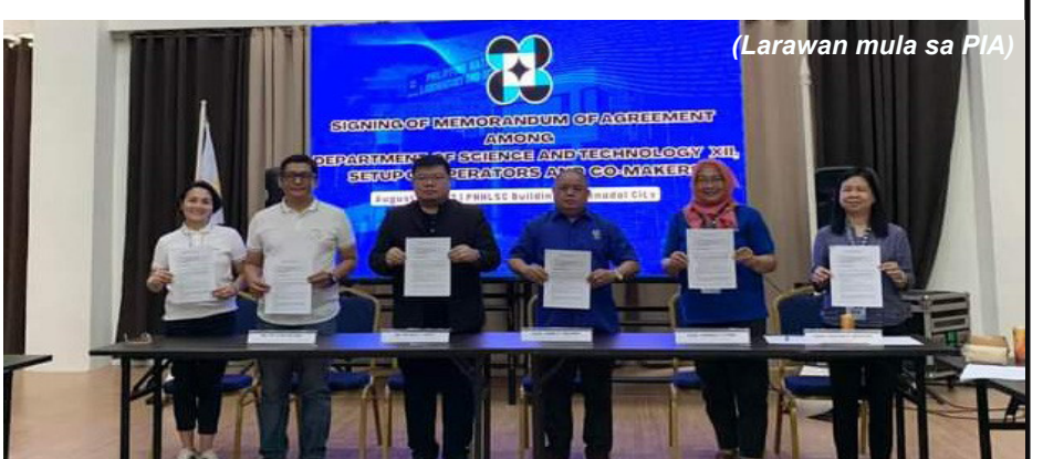
Industriya ng saging at abaka sa Kidapawan, pinalalakas ng DOST XII---p.11

ACCEPTING ADS, PLEASE CALL: 0977-7844136/ 0968-7122927