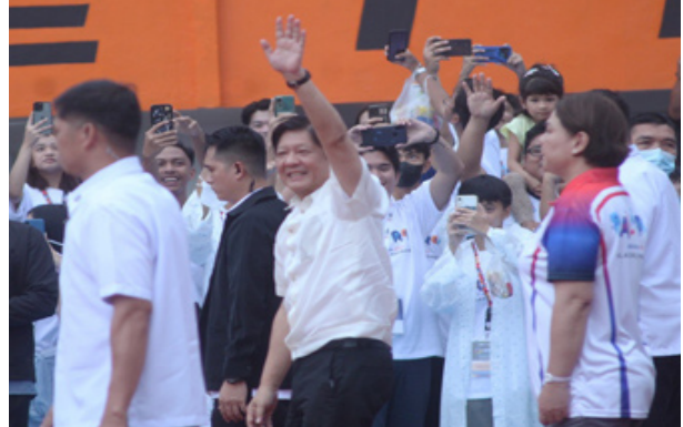
KAWAY NG PANGULONG FERDINAND E. MARCOS ANG Pangulong Ferdinand "Bongbong" Marcos, Jr. Kasama si VP DepEd Secretary Sara Z. Duterte sa kanyang pag kaway sa mga delegado ng sinimulang Palarong Pambansa sa Marikina Sports Center sa Marikina City.