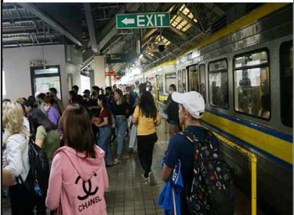
SINIMULAN nitong Agosto 2 ang pagtataas sa pasaha ng LRT line 1&2 batay sa aprubal ng Rail Regulatory Unit ng Department of Transportation. Pinayuhan ang mga mananakay sa pagbili o paggamit stored value card o BEEP CARD upang mas makatipid at makaiwas abala. CHRISTIAN HERAMIS