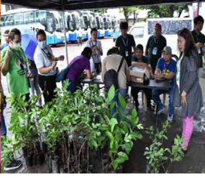
Nutri- Agri Fair---p.6A