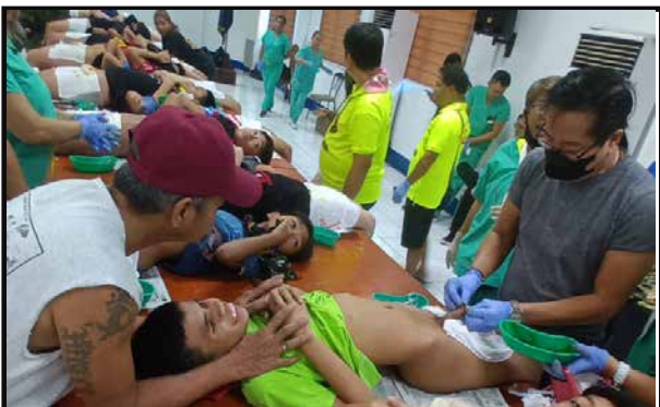
ISINAGAWA ang ikalawang taunang Community Medical Mission "OPERATION TULI" ng Association of Police Officers via Lateral Entry (APOLE) sa headquarters ng Manila Police District kamakailan.