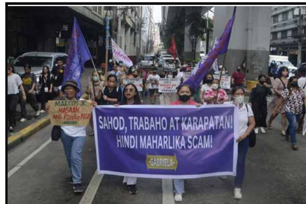
KILOS protesta ang tugon ng gabriela sa Maharlika.