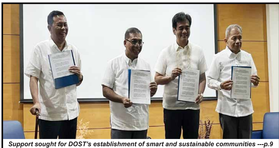
Support sought for DOST's establishment of smart and sustainable communities ---p.9