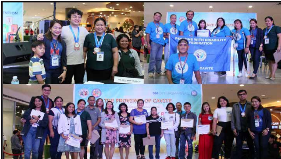
Cavite celebrates the talents of persons with disabilities ---p.2