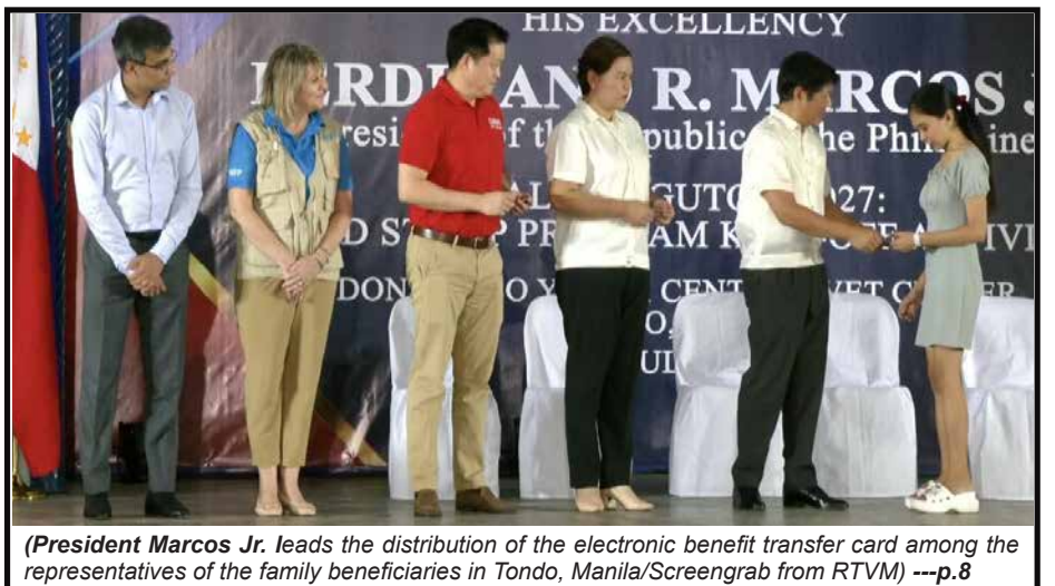
(President Marcos Jr. leads the distribution of the electronic benefit transfer card among the representatives of the family beneficiaries in Tondo, Manila/) ---p.8

ACCEPTING ADS, PLEASE CALL: 0977-7844136/ 0968-7122927